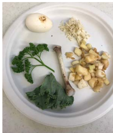
Preparing the Seder meal (Passover Meal)