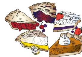
Pie & Ice Cream Social