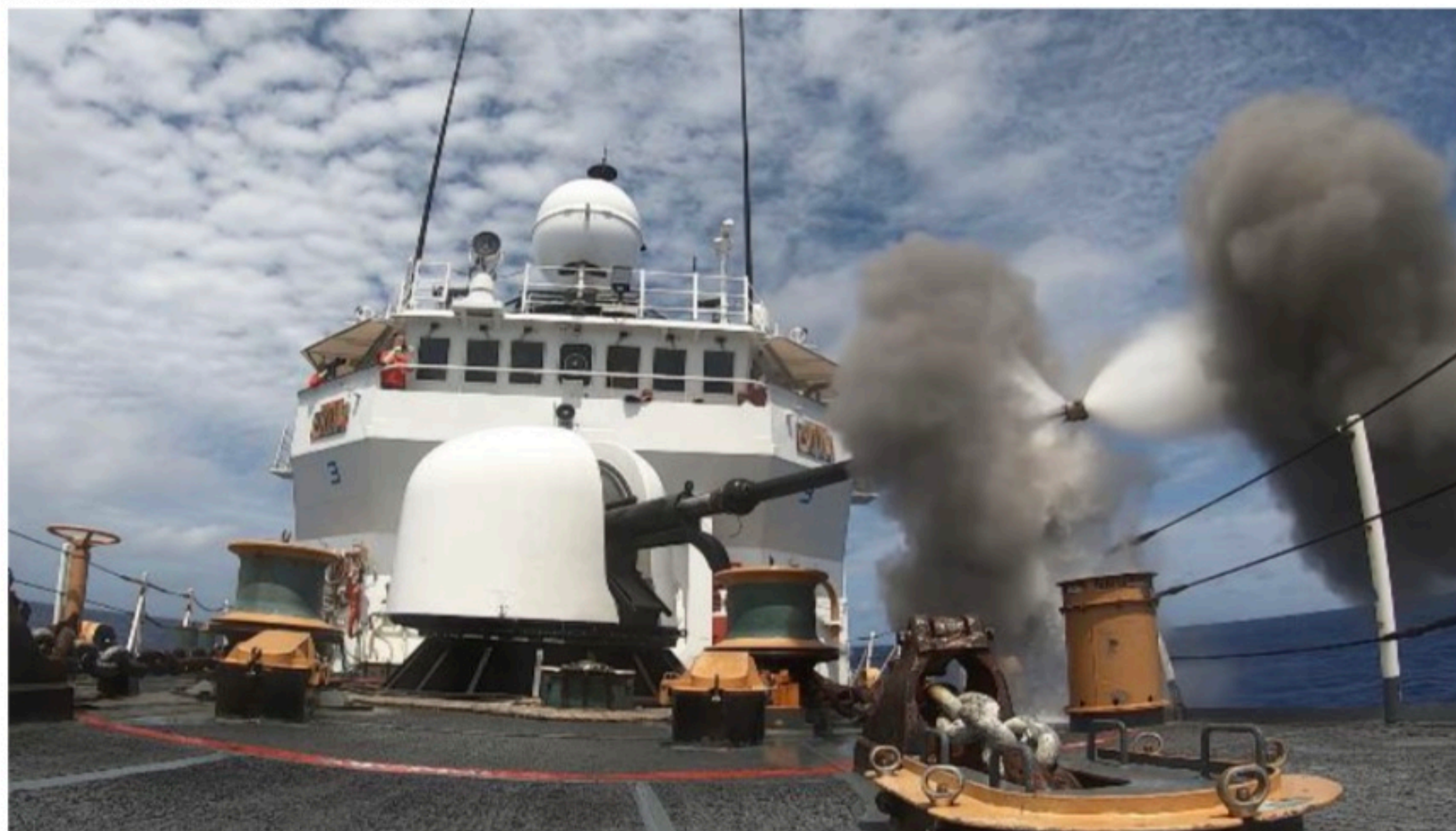
MK 75 76 mm Gun Weapon Shooting aboard USCGC NORTHLAND

Very Respectfully, XO LCDR Joshua DiPietro