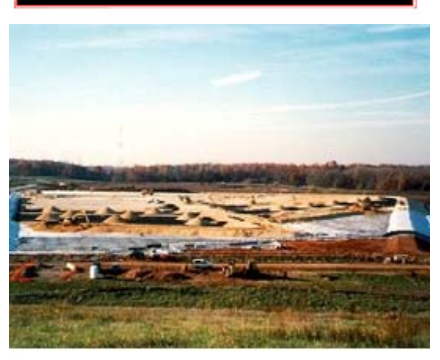
Landfill cell construction, Brown Station Road Sanitary Landfill