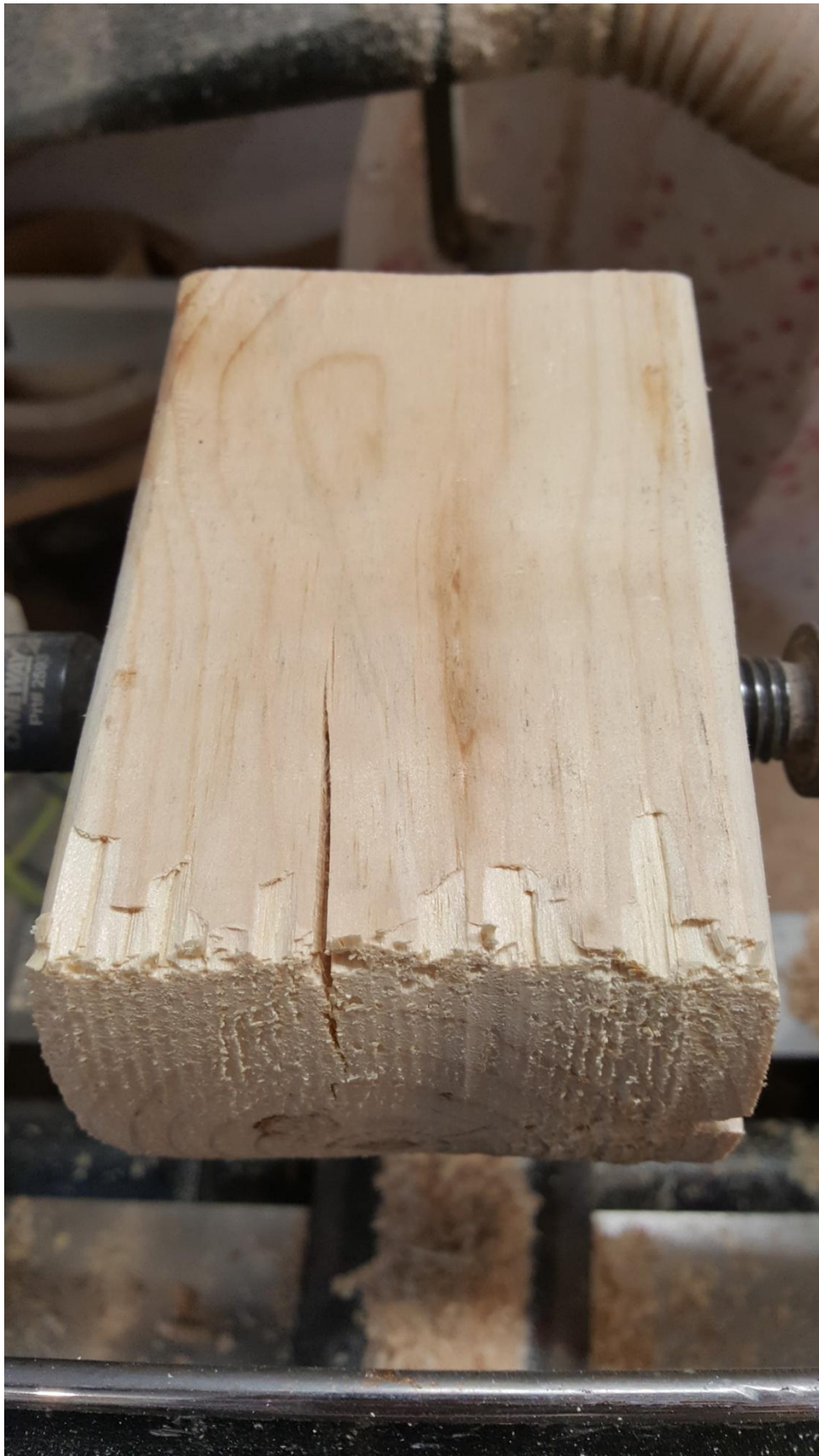
On the opposite side with the tool cutting against the grain, the wood is chipped and tore up