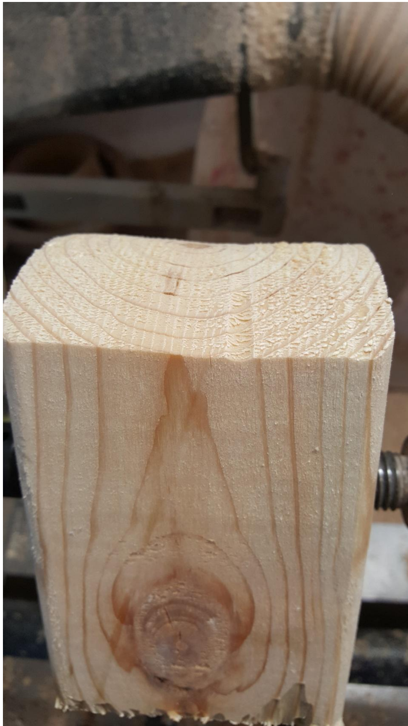
Notice that on this side of the grain, the tool is cutting with the grain