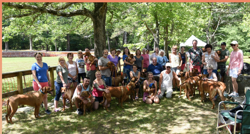
2019 Summer Social Participants