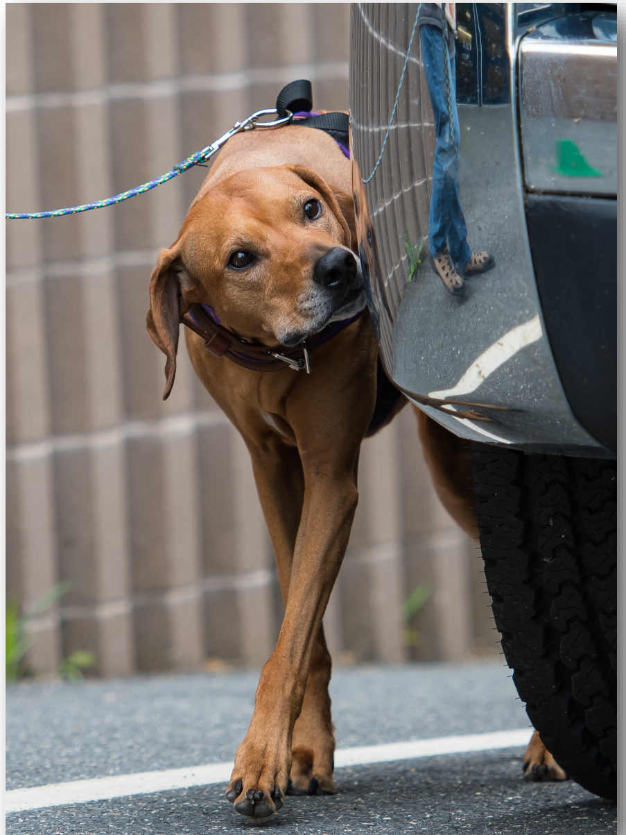
Ripley— the first Ridgeback to achieve an Elite Champion in NACSW.