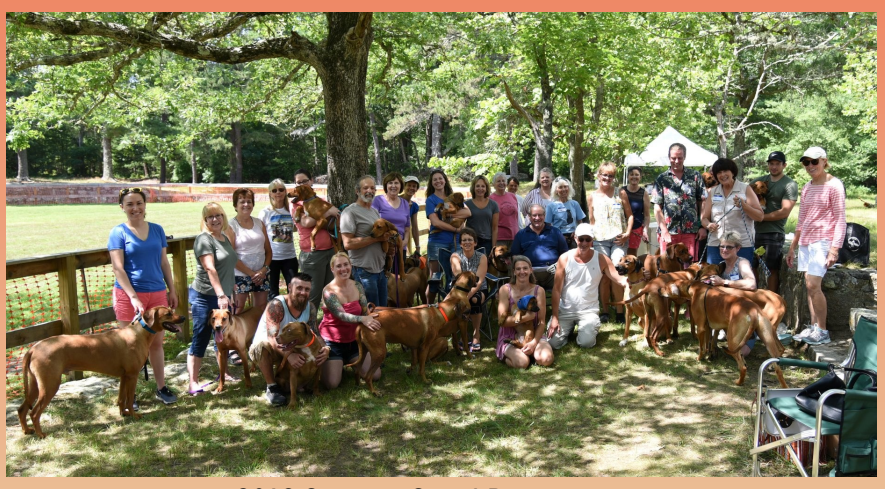
2019 Summer Social Participants