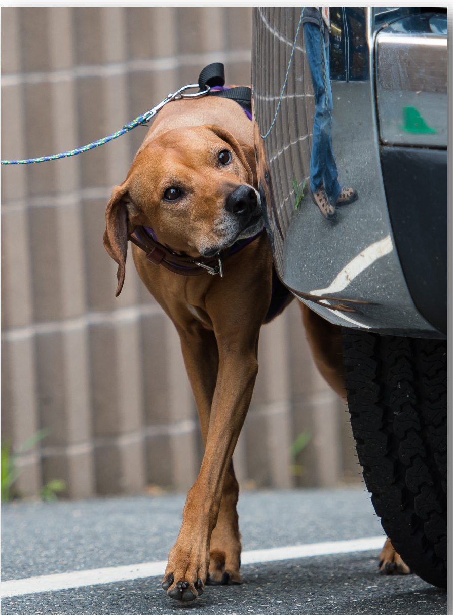
Zuva Ripley— the first Ridgeback to achieve an Elite Champion in NACSW.