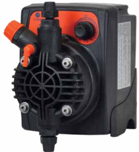
PKX FT/A - Model: 0505

Etatron's operation is NOT affected by water quality!