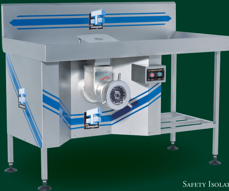
THOMPSON 42 UNDER BENCH MINCER

STAINLESS STEEL BARREL, FEEDSCREW & LOCK RING