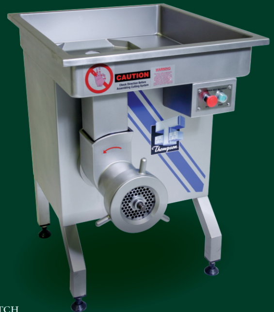
THOMPSON 42 MINCER

REMOVABLE TWIST BARREL To allow easy cleaning and sanitation