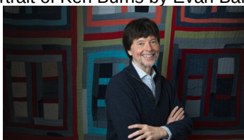
Portrait of Ken Burns

Explore Uncovered: The Ken Burns Collection at the 2022 Great Wisconsin Quilt Show! In anticipation of this special exhibit, PBS Wisconsin spoke with Ken Burns about his love of quilts and what he hopes viewers will take away from seeing his collection. Enjoy this lovely Q&A about quilts and the joy they bring us.