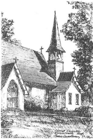
Christ Episcopal Church 220 Owensville Road West River, Maryland 20778