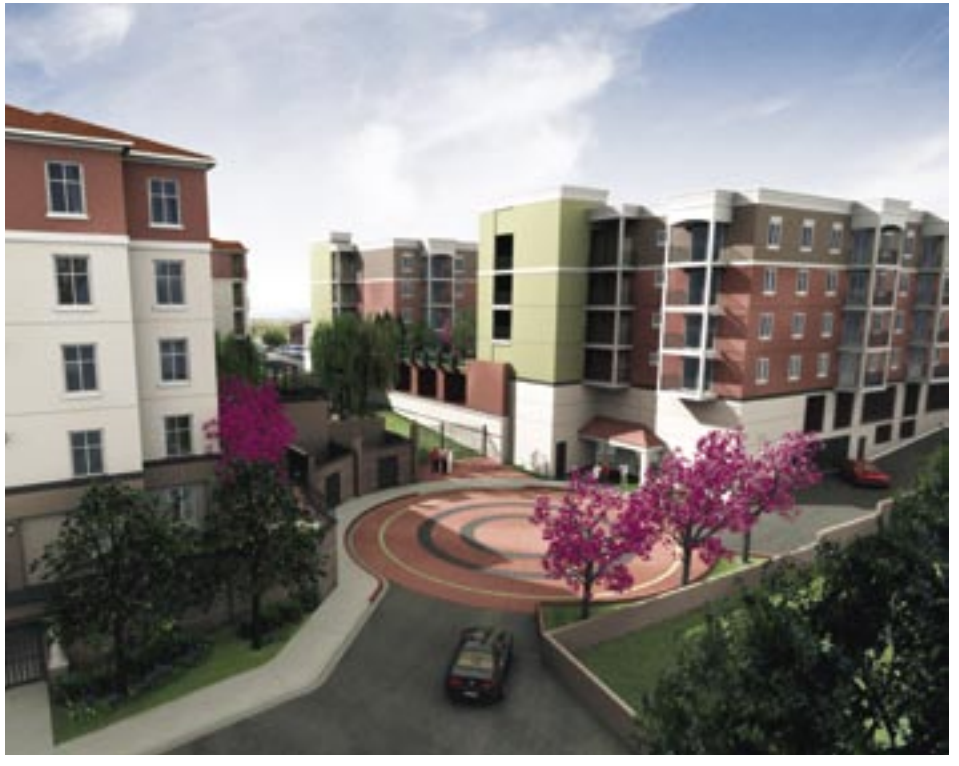
Located behind Bedford Parc, the condominiums at Bedford Promenade are a perfect place for first-time home buyers to call home.