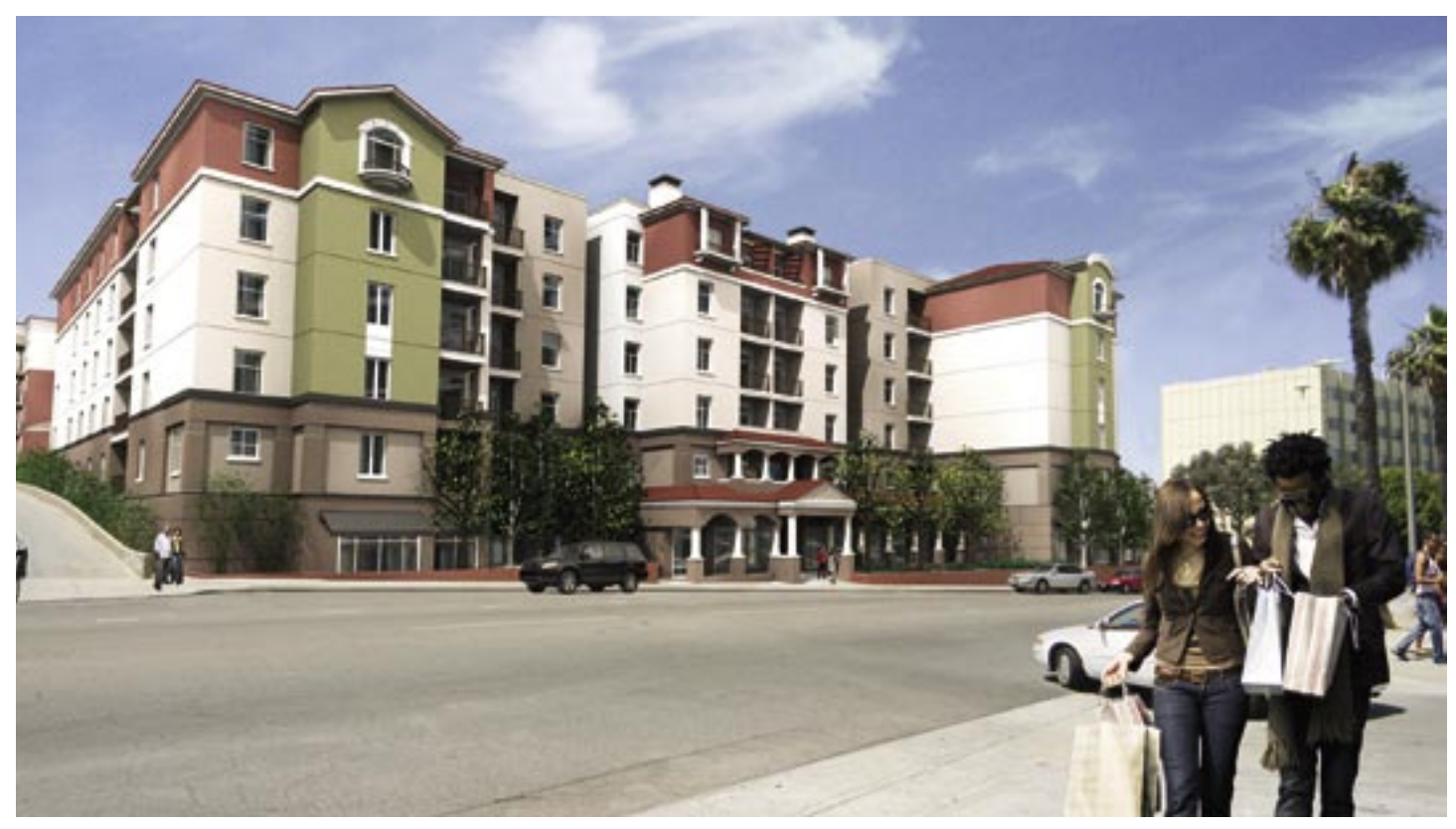
Building for the next generation. The Bedford Parc Condominiums in Urban Los Angeles' Baldwin Hills community.

recognize that wealth is created intergenerationally through asset accumulation, so we like to make sure and teach this to our clients. We let them know the value in what they are buying and how the condo purchase is an equity purchase, as well as a wealth-building strategy." This type of educational outreach goes hand in hand with the company's marketing efforts, which utilizes nontraditional channels to communicate with buyers.