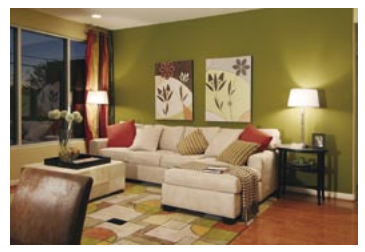
The Bedford Group likes to create warm and welcoming spaces in their living rooms. The Bedford Arbors Condominiums, North Hollywood/ Toluca Lake.

from controlled access, convenience was another consideration. The community will offer on-site concierge services designed to help residents balance their active daily lives, such as dry cleaning and travel arrangements.