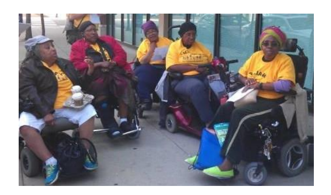
People needing human services