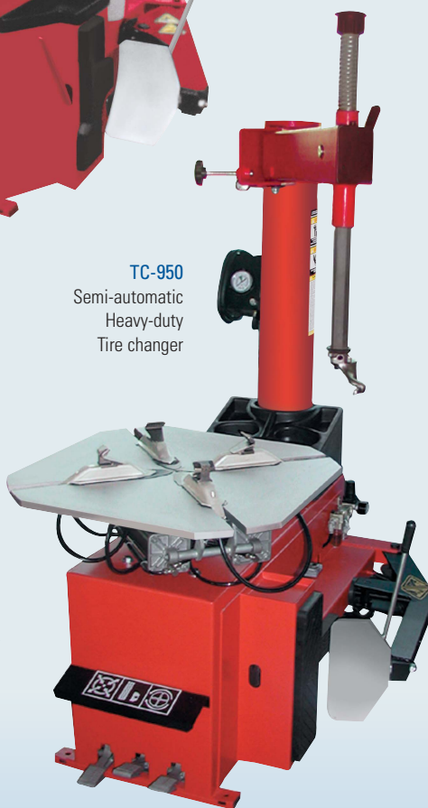
TC-950 Semi-automatic Heavy-duty Tire changer

SWING ARM DESIGN - HANDLES TIRES TO 47" DIAMETER AND RIM WIDTHS TO 15".