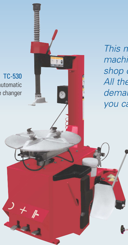
TC-530 Semi-automatic Tire changer

This model is a great machine for a small shop on a tight budget. All the features you demand at a price you can afford.