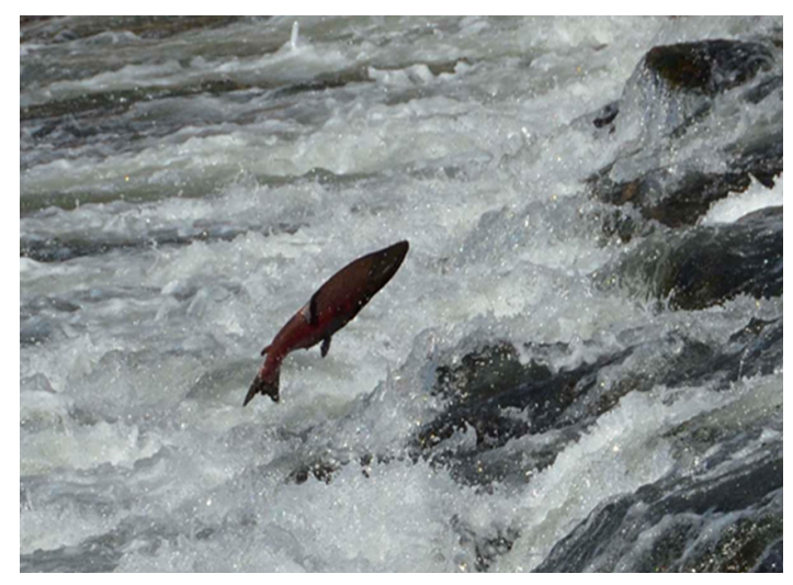
The DCC gates protect out-migrating salmonids from entering the interior Delta and help improve fish passage.