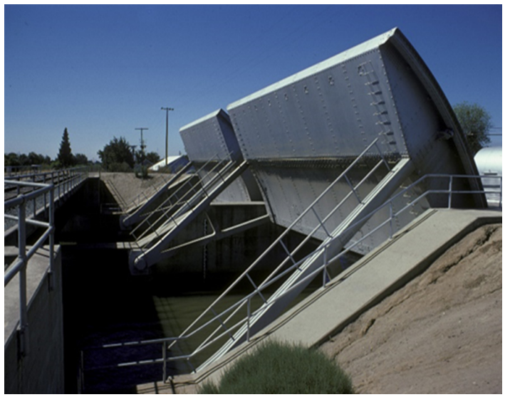
Two radial gates, each 60 \times 30 feet and weighing a total of 243 tons, open to allow water to flow down the channel, or close to prevent drawing endangered fish species into the interior Delta.

Reclamation is currently investigating alternatives for modernizing the operation of the DCC gates to allow for more frequent operation. Improvements are also expected to increase the structure's operational life, decrease operation and maintenance costs, increase the safety of employees, and improve conditions for recreational boaters.