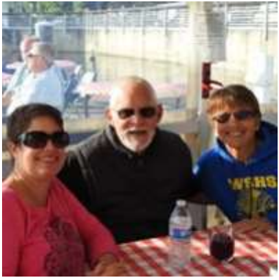
Summer Cruising Fun