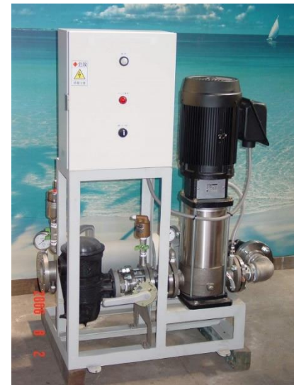
* A picture with optional control box.

Price: US$ 45,000 EXW Japan (Single unit price. Multi units purchase price and other discounts available)