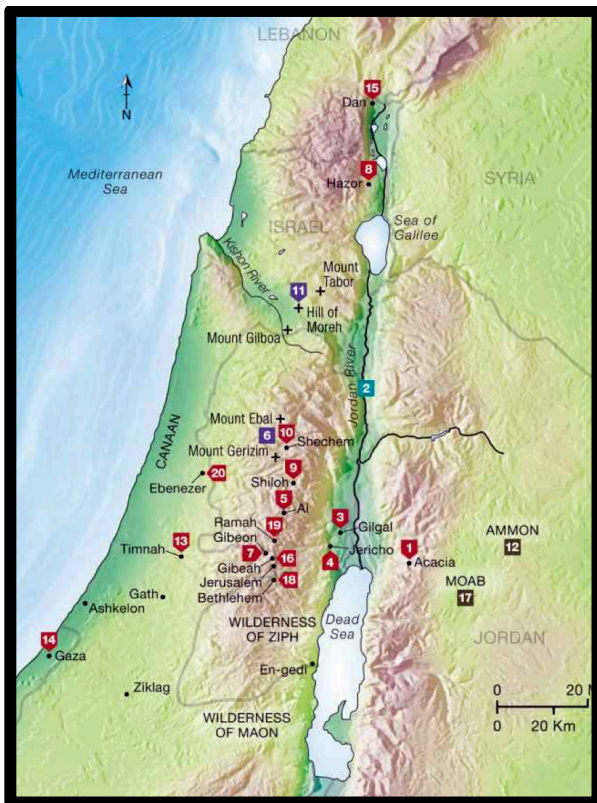
Life Application Bible

Coastal Plain and Esdraelon (Jezreel Valley) remained out of Israel's control. -- Canaanites Galilean tribes separated by Esdraelon (Jezreel Valley) from central hill country Terrain in middle hill country produced local dominance Local interests quite naturally tended to take precedence over the common good. .... Indeed, but for the spiritual power of the covenant league with its peculiar institutions, Israel would scarcely have held together at all. – Bright, p. 177