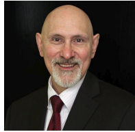
Consultant, Instructor/Presenter, and Job Coach