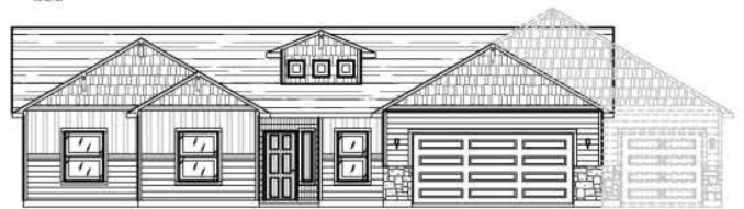
ELEVATION "C" Optional 3rd CAR GARAGE Available w/ All Elevations

This is being provided to you as a sales tool to assist in your buying decision. The exterior view is an artist's conception that may vary in detail from the actual house. This drawing is the property of White Diamond Construction. It shall be treated as confidential and must not be used to our disadvantage. It shall neither be reproduced nor altered, nor made available to third parties without prior written consent.