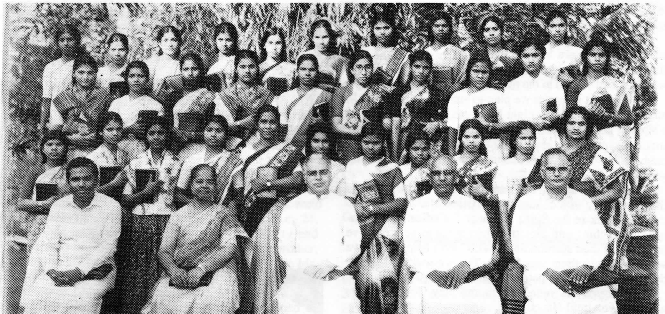
Hebron Bible College - Women's Session