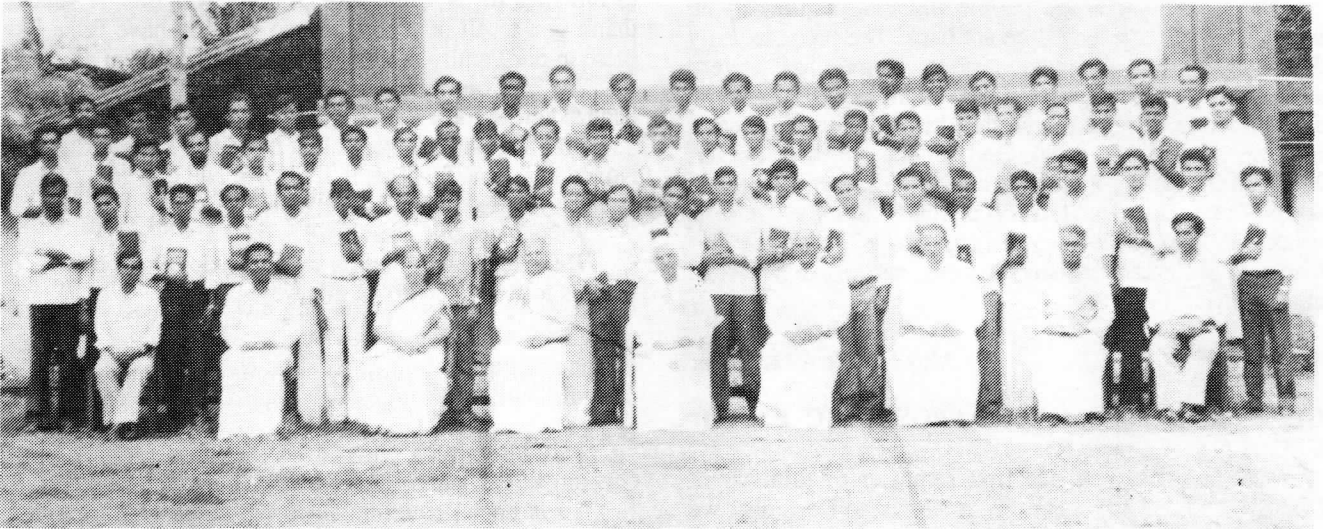
Hebron Bible College - Men's Session