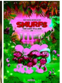
SMURFS: THE LOST VILLAGE