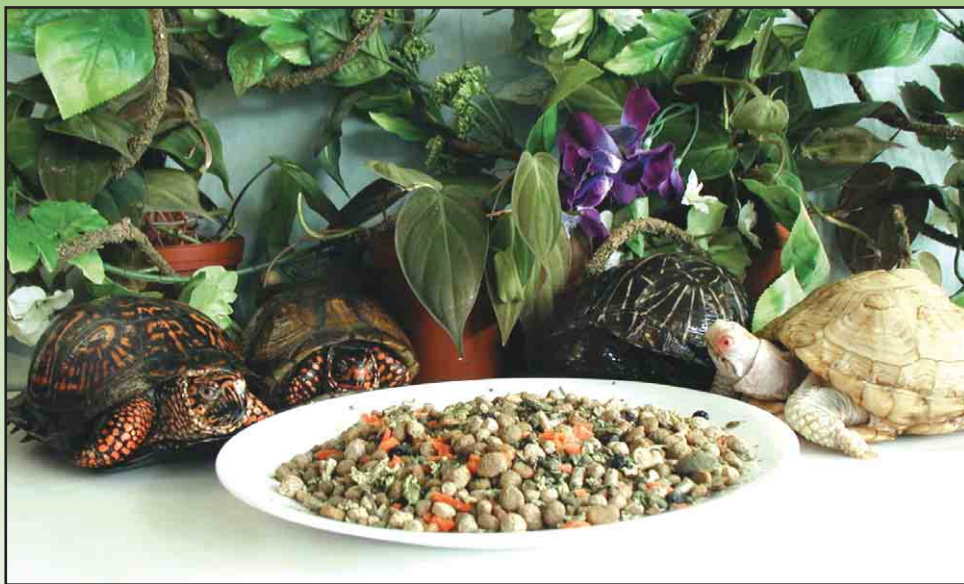
Left to right, Red (Eastern box), Trey (3-toed box), Hernando (Florida box) and Pinky (albino Eastern box)

O ur Quantum Series Box and Wood Turtle foods are complete and balanced diets of specialized pellets and Certified Organically Grown forages, berries and vegetables. The foods feature designs and formulations that are unparalleled in herpetoculture.