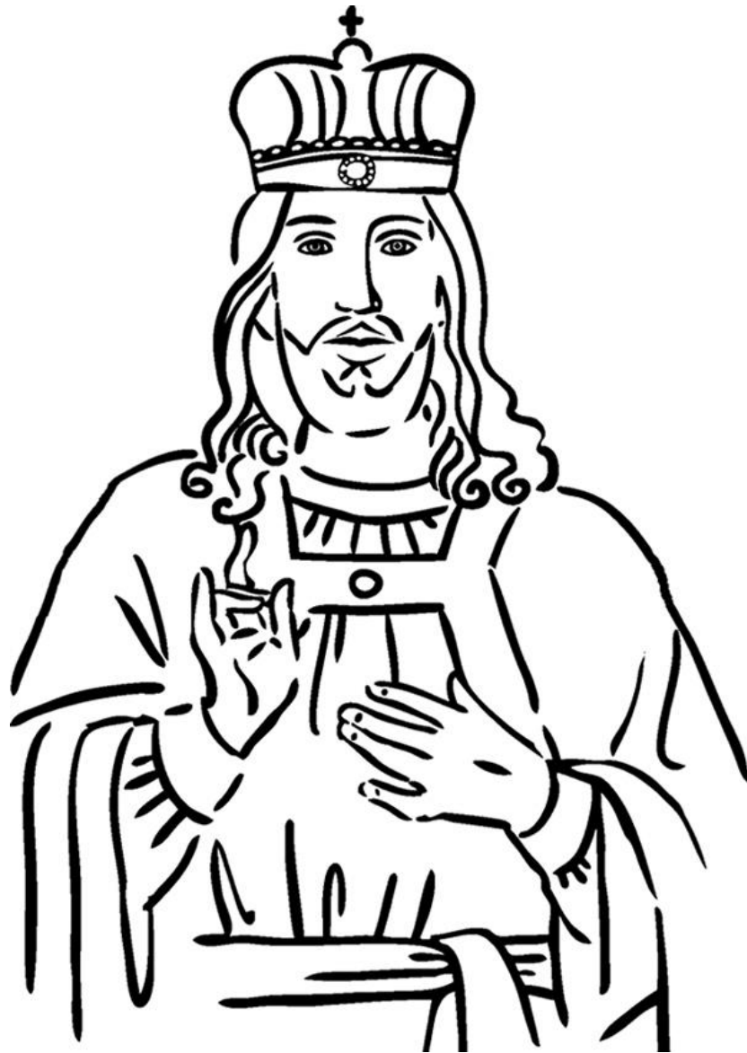
Christ the King John 18:33-37