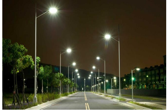
Fig 1: Highways with no traffic or pedistrians.