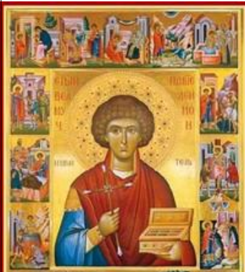
Gr. Martyr and Healer St. Panteleimon