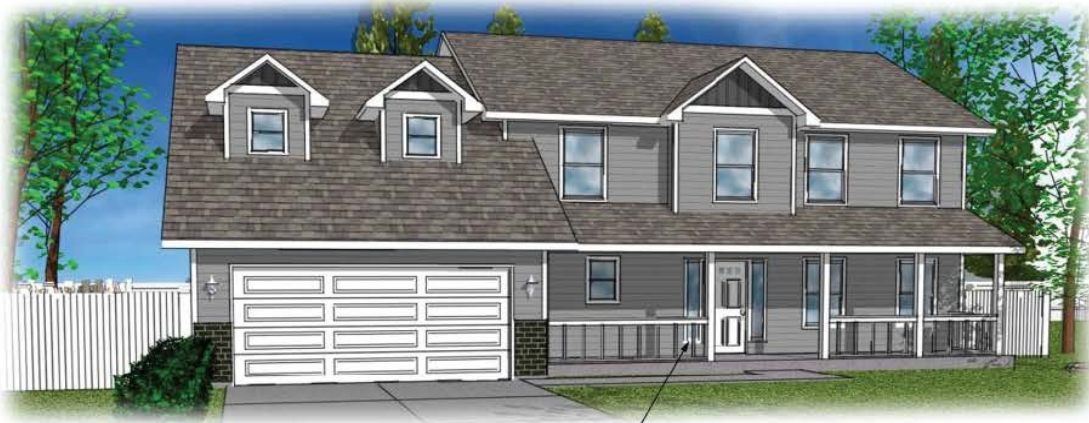
Shown with Optional Railing

All measurements, dimensions and square footage are approximate and may vary. Prices may change without notice.