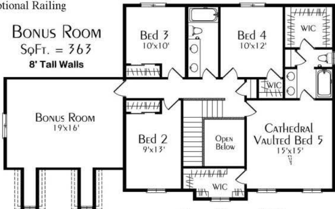
Top Floor "B" SqFt. = 1032 8' Tall Walls