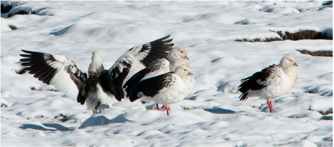
Andean Geese (Milloc)