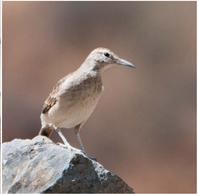
Great Inca-Finch - endemic; Thick-billed Miner – endemic (both Santa Eulalia valley)