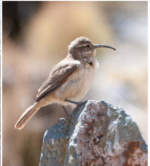
White-capped Dipper; Plain-breasted Earthcreeper (both near to Milloc)