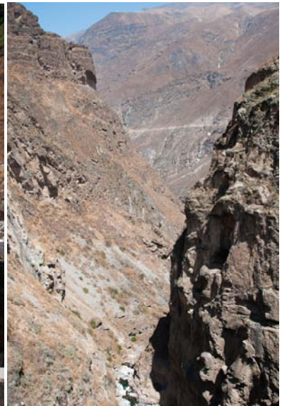
Bridge over the Santa Eulalia valley and view from the bridge back down the vertiginous gorge