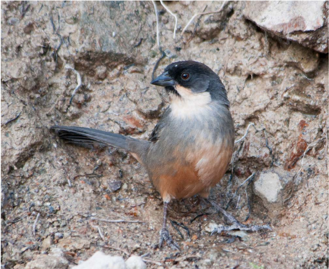
Rusty-bellied Brush-Finch [endemic] visiting clay lick (Santa Eulalia valley)