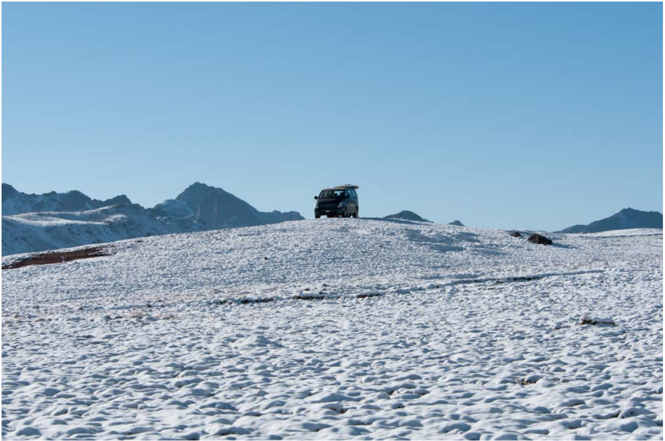
Early-morning view of our comfortable van perched at the snow-covered Bofedal de Milloc @ ca. 4800m ASL