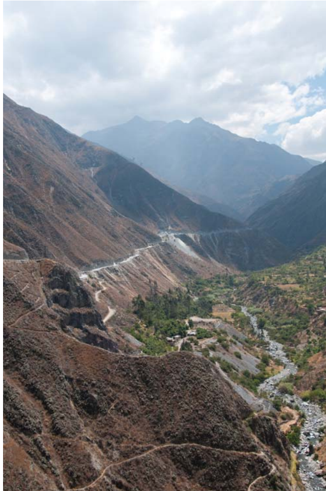
View along the Santa Eulalia valley