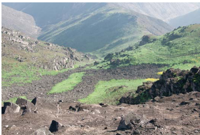
Coastal Miner - endemic; Unusually green view of desert hillsides, thanks to recent rains (both at La Molina, Lima)