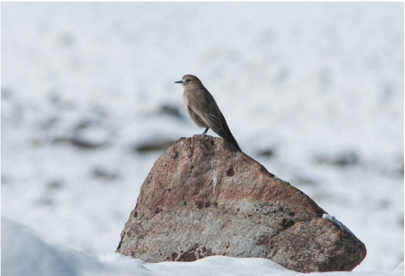
Cinereous Ground-Tyrant (Milloc)