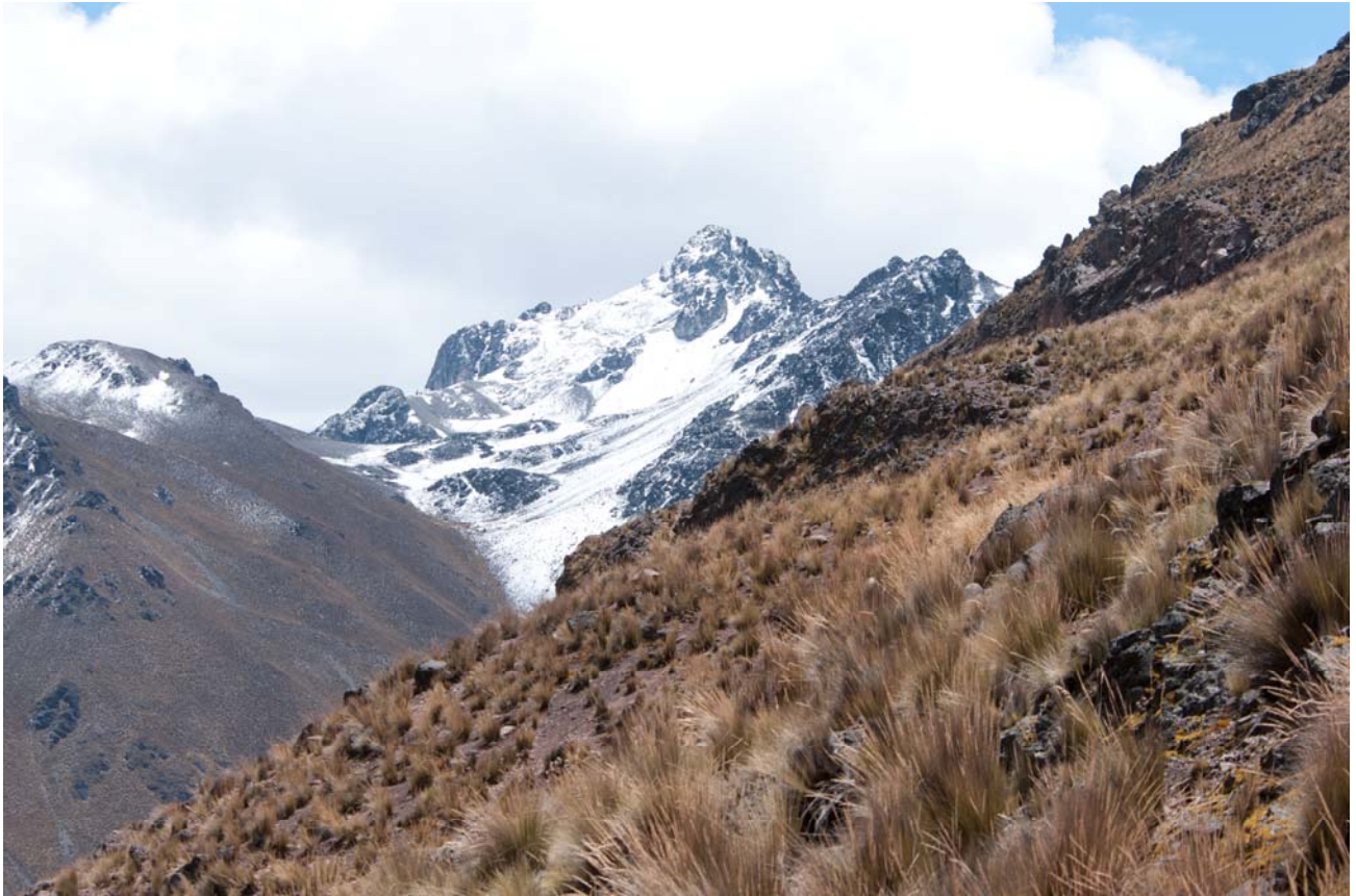
Puna landscape at Milloc in the Cordillera de la Vidua