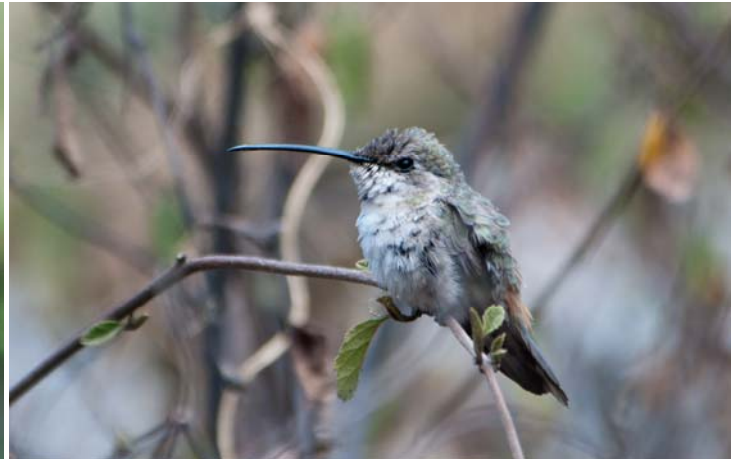
Black-necked Woodpecker [female] – endemic; Oasis Hummingbird [female] (both Santa Eulalia valley)