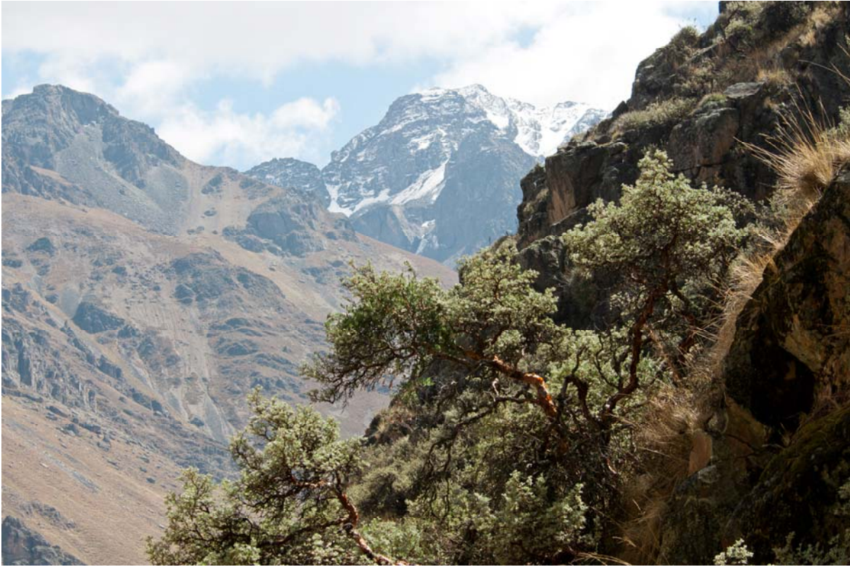
Polylepis forest above the Rio Paccha