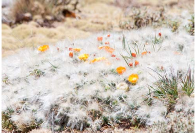
Puna vegetation at Milloc