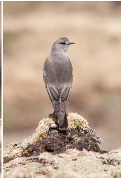
White-bellied Cinclodes - endemic; Puna Ground-Tyrant (both at Ticlio @ ca. 4900m ASL)