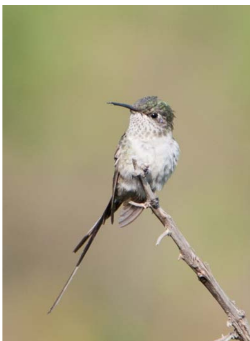
Blue-and-yellow Tanager; Peruvian Sheartail (both Santa Eulalia valley)