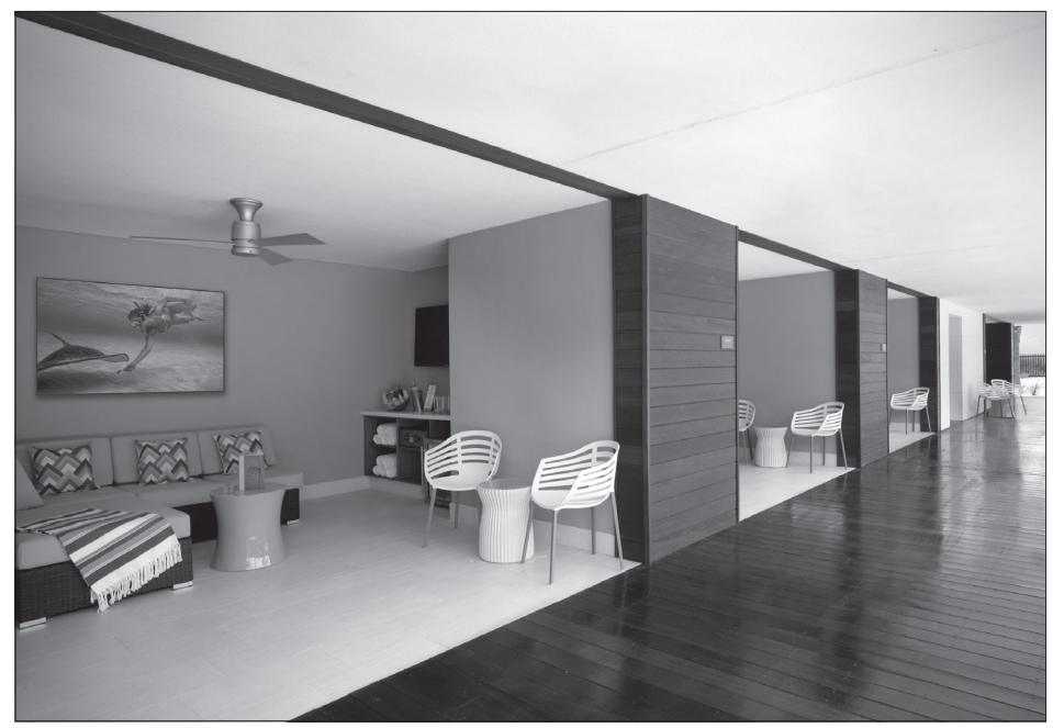
Don't settle for just a lounge chair! You can have your own bungalow near the pool. Comes furnished and includes a TV, fridge, towels, water and safe. Have food brought in while you relax

Viento is the main restaurant at Zota. Dine in or al fresco