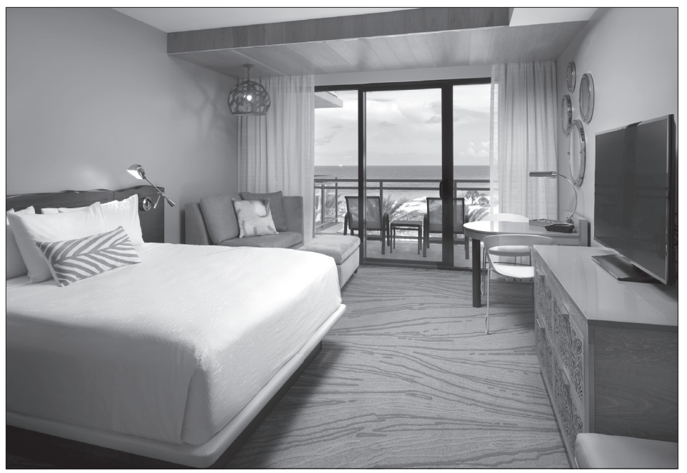
A room with a (gorgeous) view – this is the King Size room with balcony

Viento is the main restaurant at Zota. Dine in or al fresco