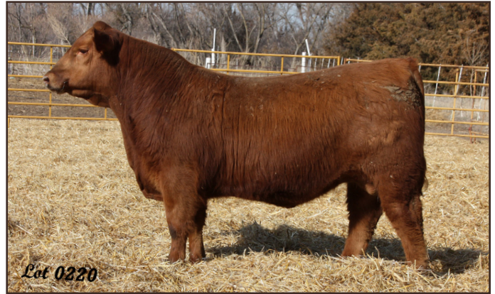
WFRA 0220, pedigree above.