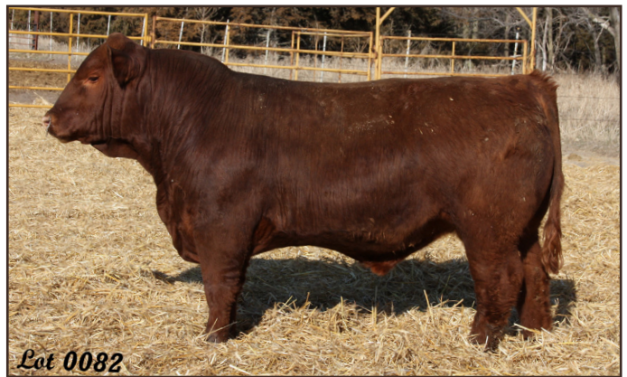
WFRA No Worries 0082, pedigree left.