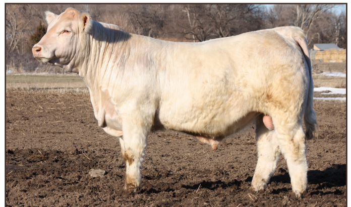
WFR Cash Back 05 P, Lot 05.

These are the first Cashing Out sons to sell this year and WFR Cash Back 05 is one of the best bulls ever raised on the ranch.. His dam 633 is a outstanding cow in the herd.