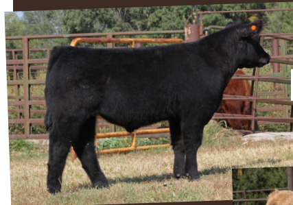
118 - Here I Am steer