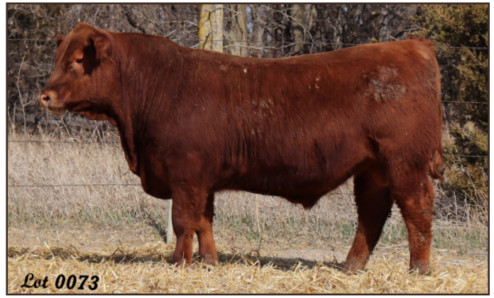
WFRA Cinch 0073, pedigree left.