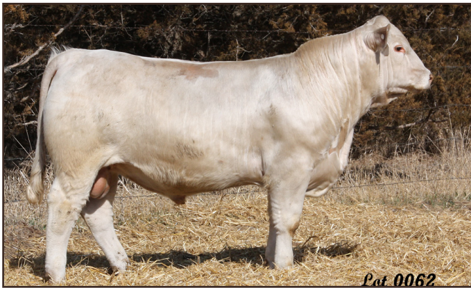
WFR Venture 0062 P, pedigree on page 13.