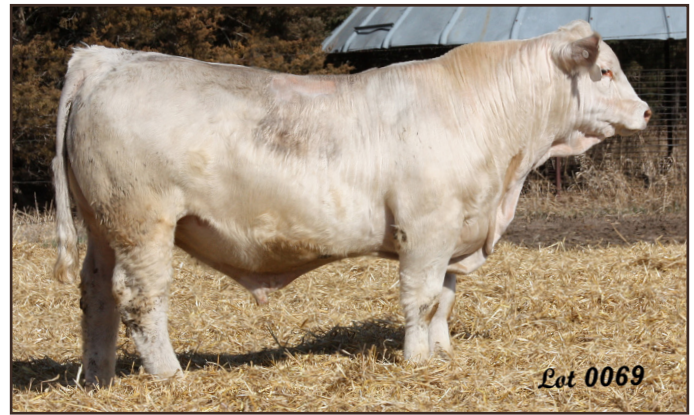
WFR Affinity 0069 P, pedigree on page 14.