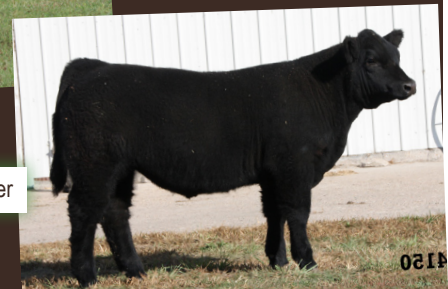
4150 - Man Among Boys Steer