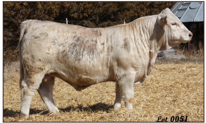
WFR Affinity 0051 P, pedigree on page 11.