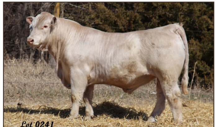
Pet 0241 WFR Tank 0241 P, pedigree above.