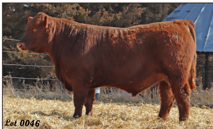
WFRA Feel Good 0046, pedigree left.