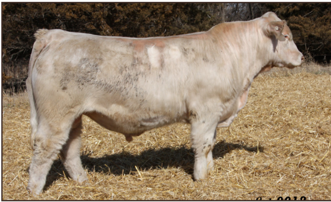
WFR Rhinestone 0018 P, pedigree on page 10.