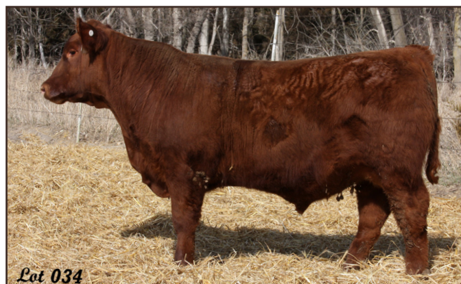
WFRA 034, pedigree left.