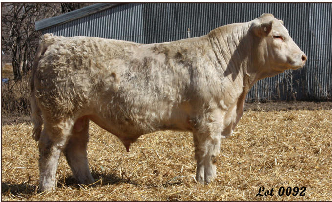
WFR Addiction 0092 P, pedigree on page 14.