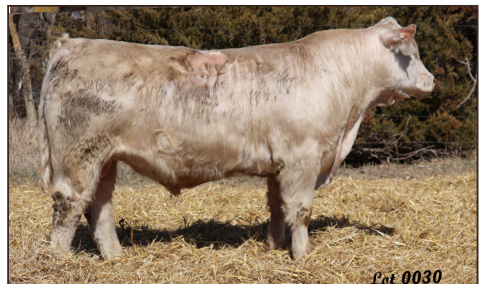
WFR 0030 P, pedigree above.