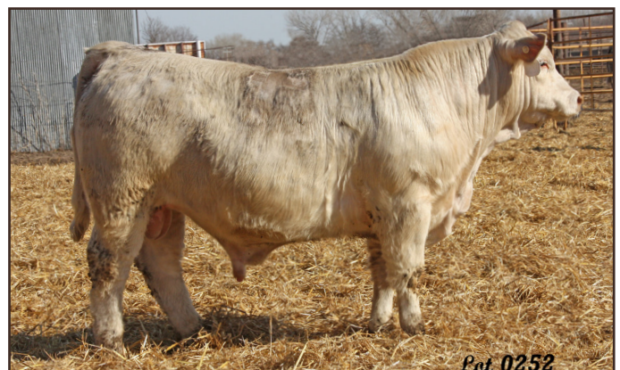
WFR 0252 P, pedigree on page 15.