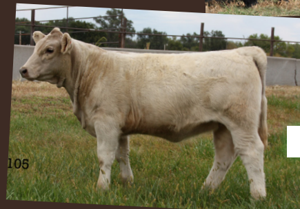
2105 - Drink In My Hand Heifer