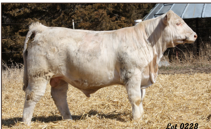
WFR Cash 0228 P, pedigree on page 15.