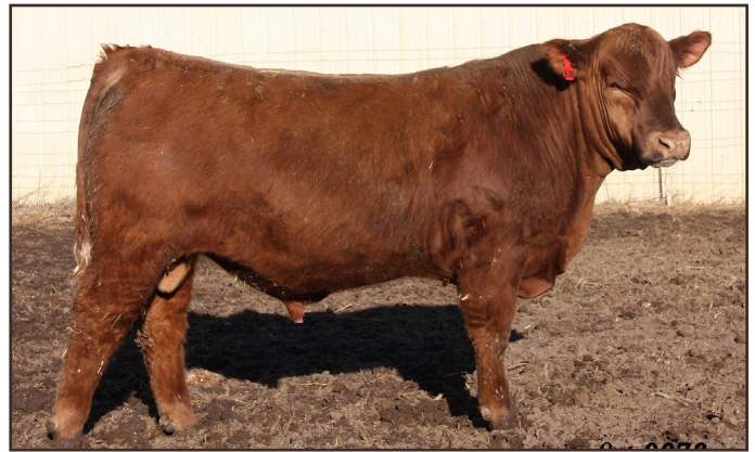
WFRA Cinch 0078, pedigree left.