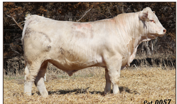
WFR Affinity 0057 P, pedigree left.