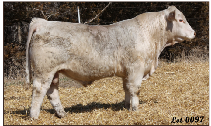
WFR Drink 0097 P, pedigree on page 15.