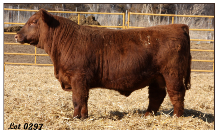
WFRA Firestorm 0297, pedigree left.