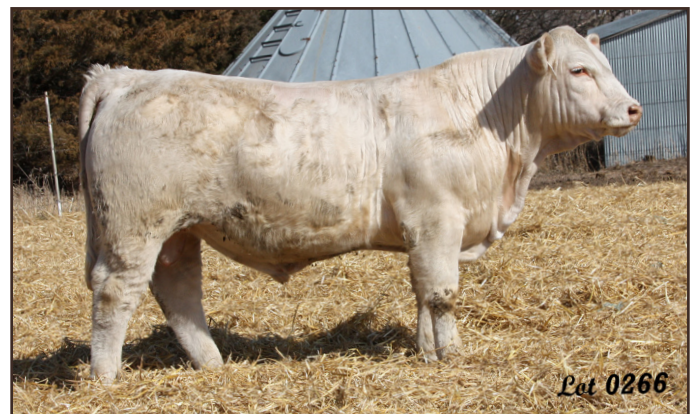
WFR Rhinestone 0266 P, pedigree above