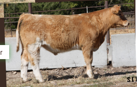
112 - Man Among Boys Steer