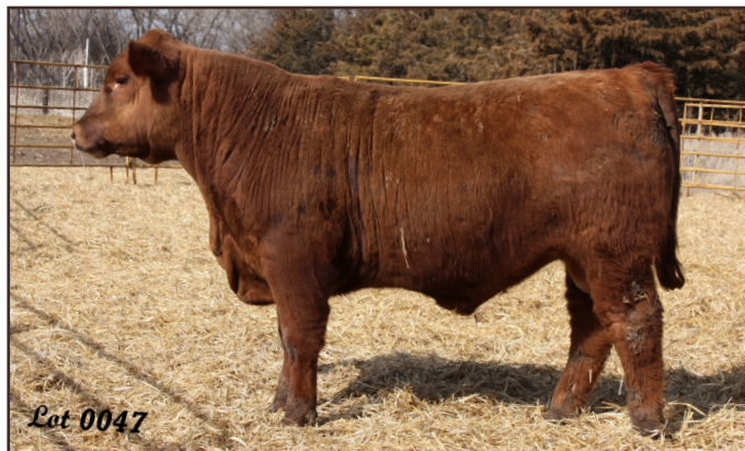
WFRA Feel Good 0047, pedigree left.