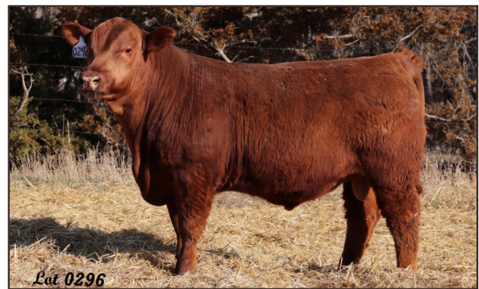
WFRA 0296, pedigree left.