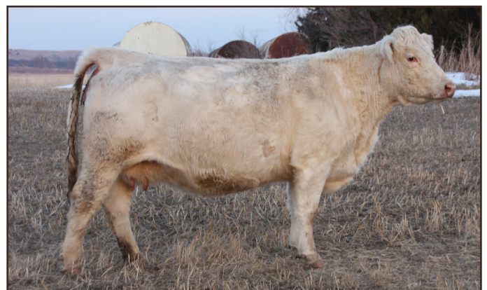
WFR Valerie 633 P, dam of WFR Cash Back 05P.

One of my favorites. He has an outcross pedigree that is stacked with some great genetics. He is good footed, deep bodied, wide tracking, has a lot of eye appeal and a big top with a 16.17 REA. And to top it all off he has an amazing disposition. Selling 2/3 semen interest and full possession.