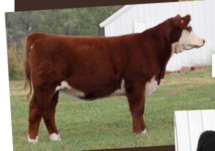
384 - Man Among Boys Heifer