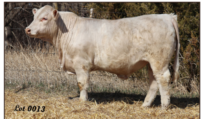
WFR Cash 0013 P, pedigree left.