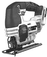
Jig saw $71