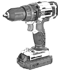
20V drill $88