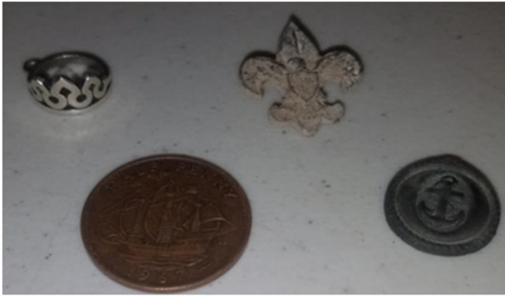
GEORGE - JULY 2017 RELIC WINNER - BOYSCOUT EMBLEM