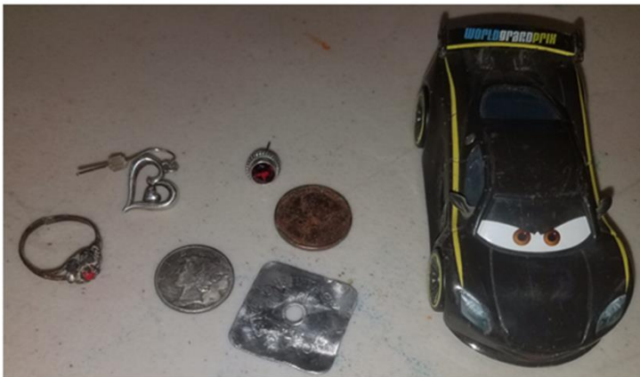
GLEN - JULY 2017 JEWELRY WINNER - SILVER EARRING

New Business (cont'd): Attendance ticket drawing lucky winner was LD with ticket #187 and as usual, all winners received Walmart gift cards! At 7:15 pm, the July 2017 meeting was officially adjourned! Next meeting will be scheduled 2 August 2017 at the same location and time.