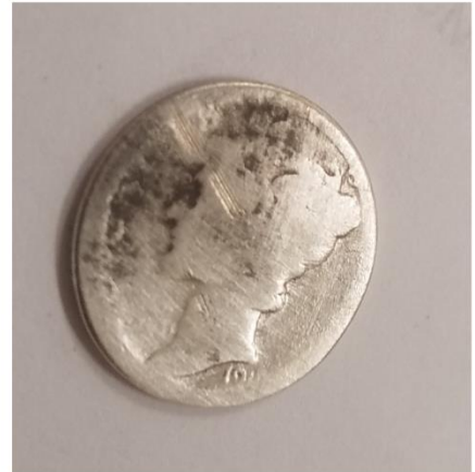
LD - JULY 2017 COIN WINNER 1911 SILVER DIME