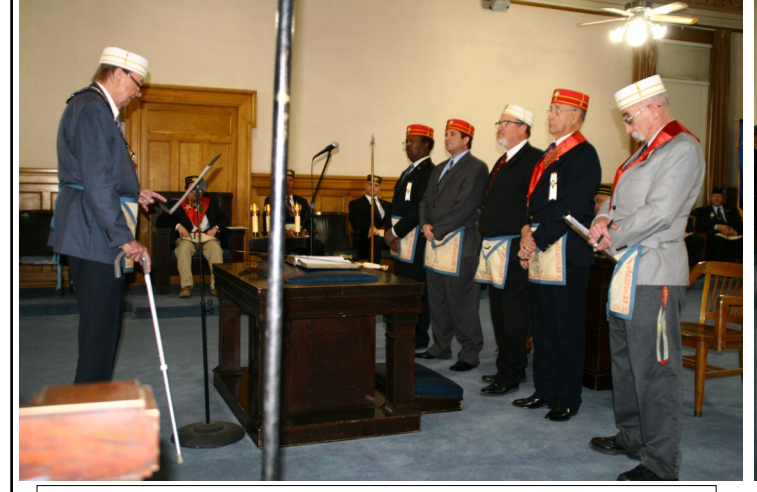
Installation of 2018 Officers during our January Stated Meeting.