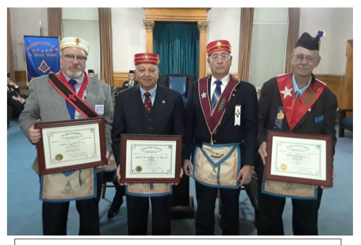
Presentation of certificates to our 2017 outgoing Officers.