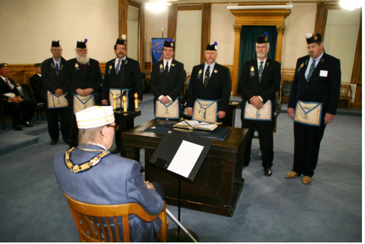
Installation of 2018 Officers for our Knights of St. Andrew