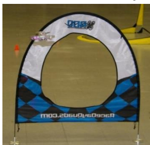
Target for Drone.