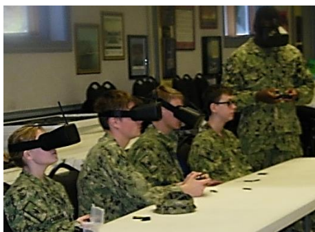
AMERICA Division Sea Cadets hard at work on Drone Project.