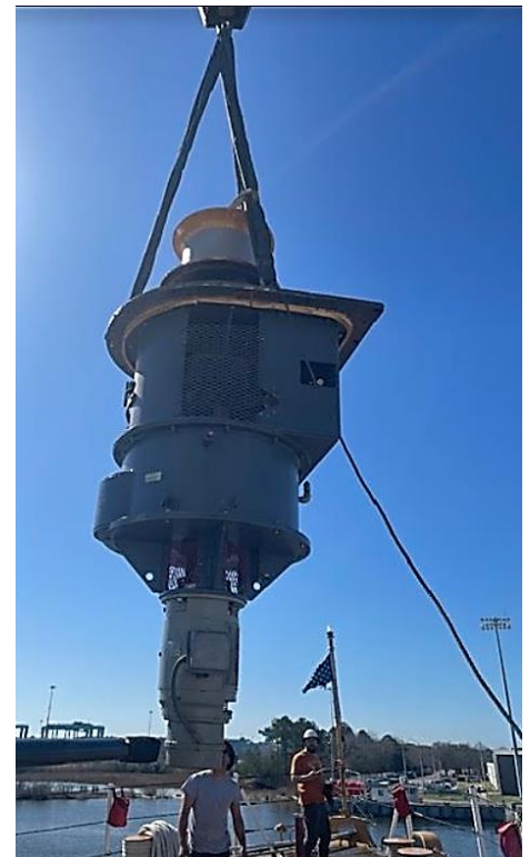
Photo of the repaired Anchor Windlass – a machine that restrains and manipulates the anchor chain on a boat allowing the anchor to be raised and lowered by means of a chain cable.

Very Respectfully, XO LTCDR Brian A. Baffer