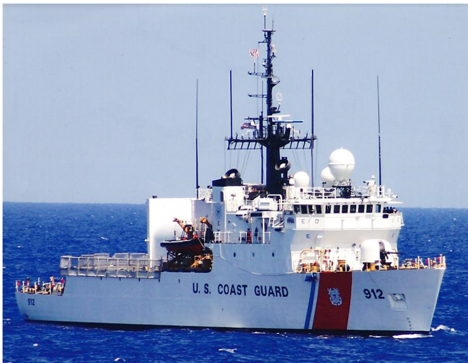
U.S. Coast Guard Cutter LEGARE (WMEC-912)