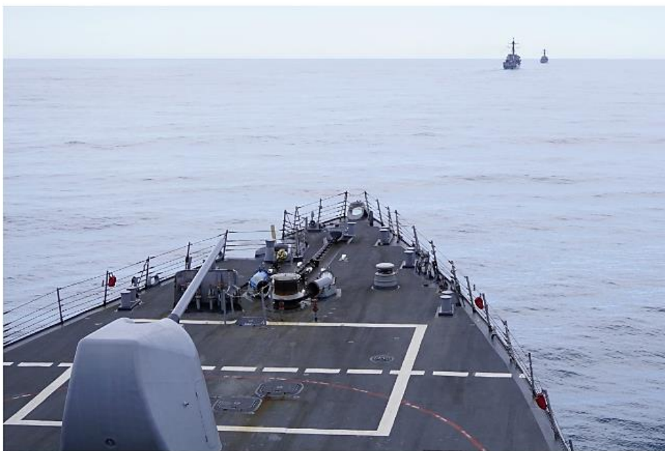
USS CARNEY (DDG-64) , moves onto station in support of live fire exercises with USS MASON (DDG-87) , left) and USS GRAVELY (DDG-107) , right).

Very Respectfully, Alexis Harrell-Parada, ENS, USN