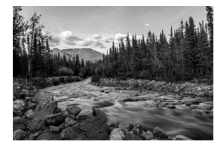
Denali National Park, Alaska - 27 Kushal Bose