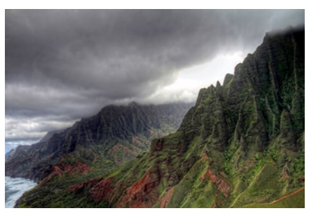
Na Pali Coast Mood - 27