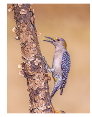
Looking For Bugs - 27 Paul Munch