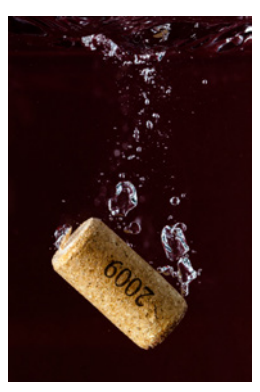
Uncorked - 27 Ken Uplinger