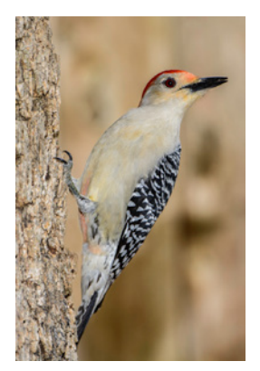
Red-bellied Woodpecker - 26 Dolph McCranie