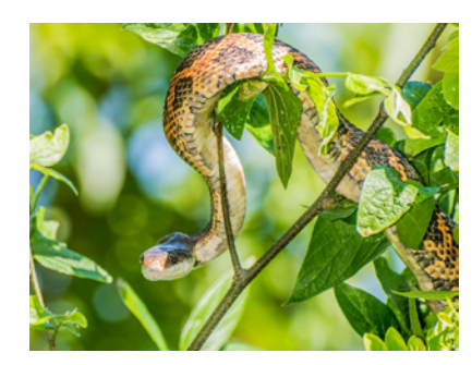
Serpent's Gaze - 27 Pamela Oldham