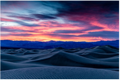
Mesquite Dunees Sunset - 27 Dan Tnissen