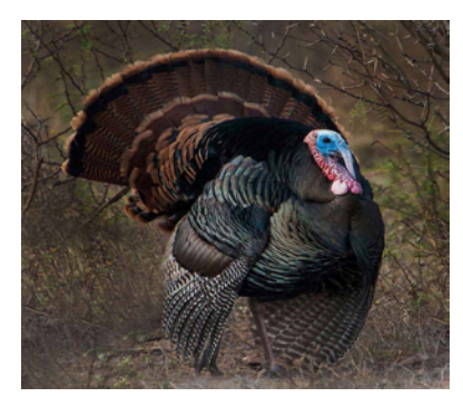
Looking for a Girlfriend - 27 Stennis Shotts