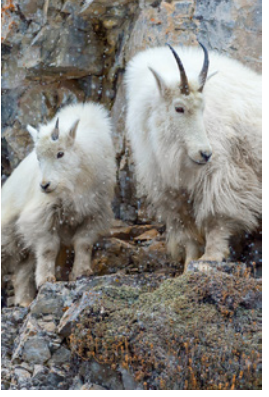
Look Mom, It's Snowing - 27 Cheryl Callen