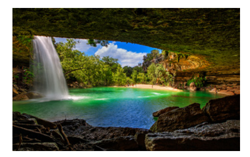
Spring at the Pool - 26 Rose Epps