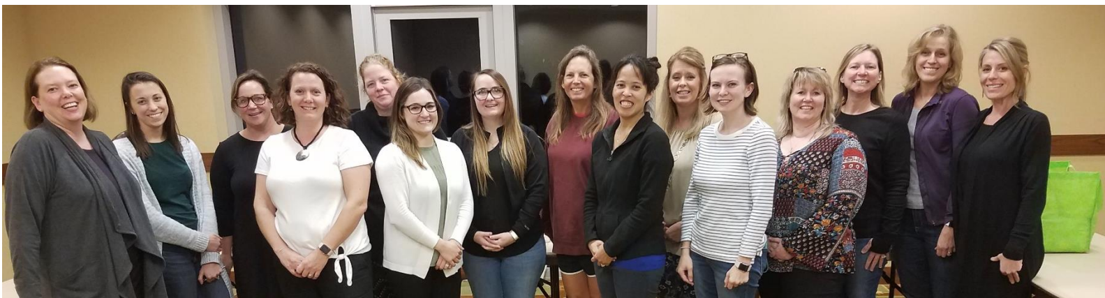
2018-2019 Board Members

Positions highlighted in yellow denote open positions