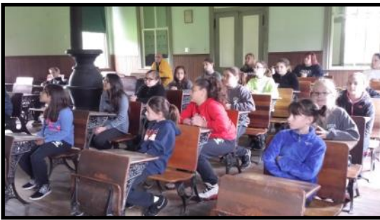
Class is in session in a one-room school house!

who we learned about this spring. We also got to see what school was like in a one-room school house, where multiple ages were taught by one teacher in a large room. It reminded us of the school that Marley attended from the book Miracles on Maple Hill . We have had an amazing spring so far, and we are looking forward to counting down the days and weeks left until summer vacation begins!