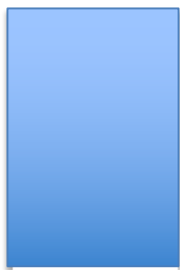
Full Page 10 3/8w x 15 1/2h