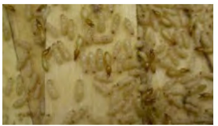
Formosan subterranean termite workers and soldiers.

Formosan termites are a more voracious type of subterranean termite. These termites have been spread throughout Texas through transport of infested material or soil. Formosan termites build carton nests that allow them to survive above ground without contact with the soil. Nests are often located in hollow spaces, such as wall voids.