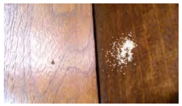
Drywood termite fecal pellets.

Drywood termites do not need contact with soil and reside in sound, dry wood. These termites obtain moisture from the wood they digest. Drywood termites create a dry fecal pellet that can be used as an identifying characteristic. They have smaller colonies- around 1,000 termites- than subterranean termites; they also do not build shelter tubes.