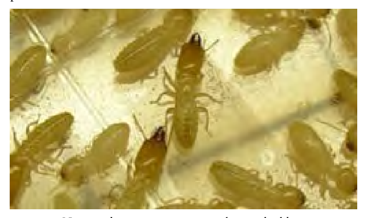
Native subterranean termite workers and soldiers.

Native subterranean termites have nests in the soil and must maintain contact with soil or an above-ground moisture source to survive. If native subterranean termites move to areas above ground they make shelter (mud) tubes of fecal material, saliva and soil to protect themselves.