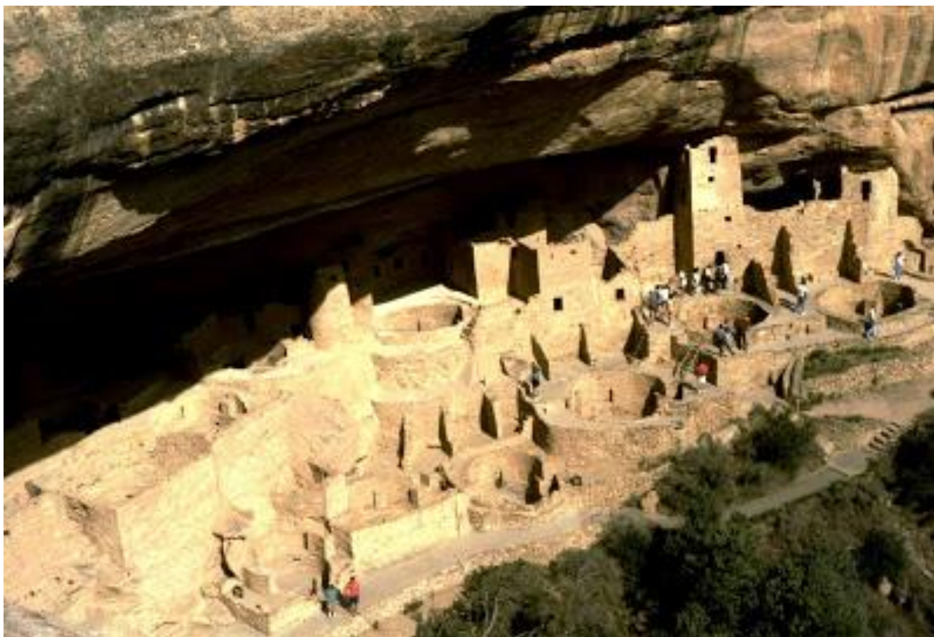
Cliff Palace, Mesa Verde, Colorado. Photograph Peter Faris, May 1988.

landscapes, with a dark (usually red) lower register marking the horizon and a white upper register as the sky (Brody 1991:57-68; Cole 2006; Newsome and Hays-Gilpin in press). These landscapes are sometimes modified with triangular "mountain" shapes that jut up from the red band into the upper register, triangular "cracks" into the lower and, or lines of dots. The repetition in these patterns suggest that time was important in Pueblo III murals, with the various dots, triangles, and other marks possibly relating to astronomical observations (Malville and Putnam 1993) or to leaders' responsibilities for scheduling rituals based on observations of the sun and sky. Newsome and Hays-Gilpin (in press) argued that the position of the observer was critical to the meaning of Pueblo III murals, for the configuration of the rooms in which they are found would have situated the viewer within the landscape and calendrical cycles defined by the paintings. They also suggested that the murals might be an early reflection of the process of linking Ancestral Pueblo people to space in a meaningful way by establishing the Center Place." (Munson 2011:85-87)