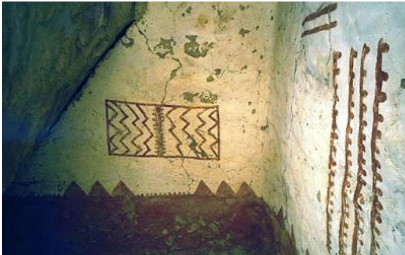
Mural 30, Cliff Palace, Mesa Verde, Colorado. Public domain photograph, National Park Service.

On November 26, 2016, I posted a column titled Huerfano Butte, New Mexico, as the Model for Painted Mountains at Mesa Verde? (Column also published in November 2016 edition of Pictures from the Past Newsletter .) In this I posited that the theme of three mountains painted in a kiva at Eagle's Nest ruin on the Ute Mountain Ute Reservation, as well as the three mountain painting at Spruce Tree House were inspired by the small triple peaks of Huerfano Butte.