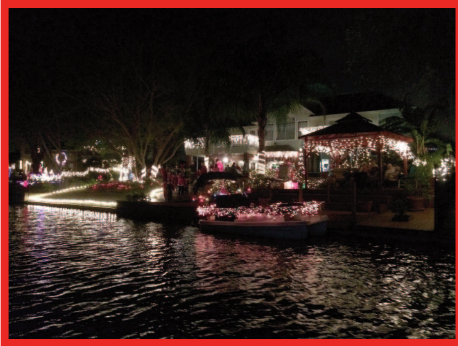
Armando & Alina Solorzano at 14015 Ragus Lake Drive