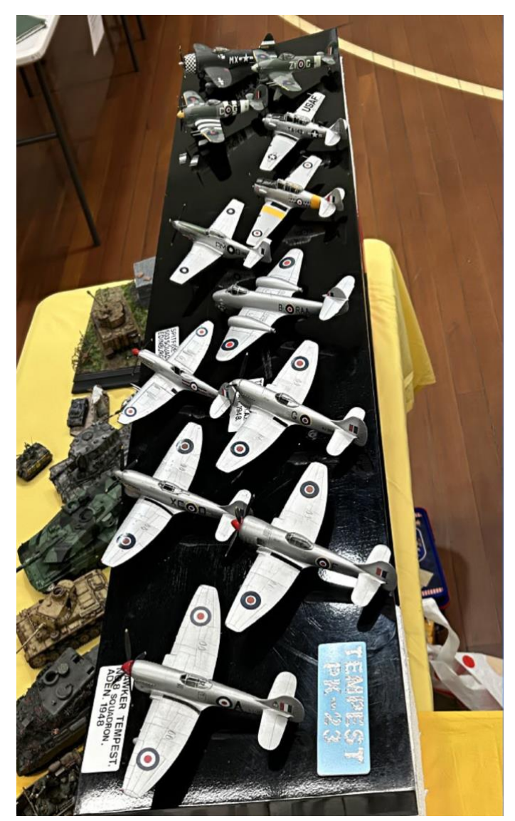
Scale Views - Issue 2 2023