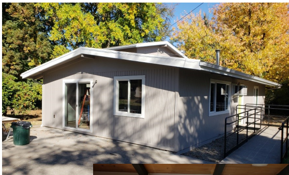
The newly renovated Family Promise Day Center