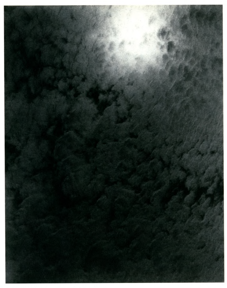
6 • Alfred Stieglitz, Equivalent , c. 1927 Silver-gelatin print, 9.2 x 11.7 (35/8 x 45/8)

reality; essential not because the photographic image is unlike reality in being flat, or black and white, or small, but because as a set of marks on paper traced by light, it is shown to have no more "natural" an orientation to the axial directions of the real world than do those marks in a book we know as writing. It is in this "equivalence" that "straight" photography and modernism effortlessly join hands.