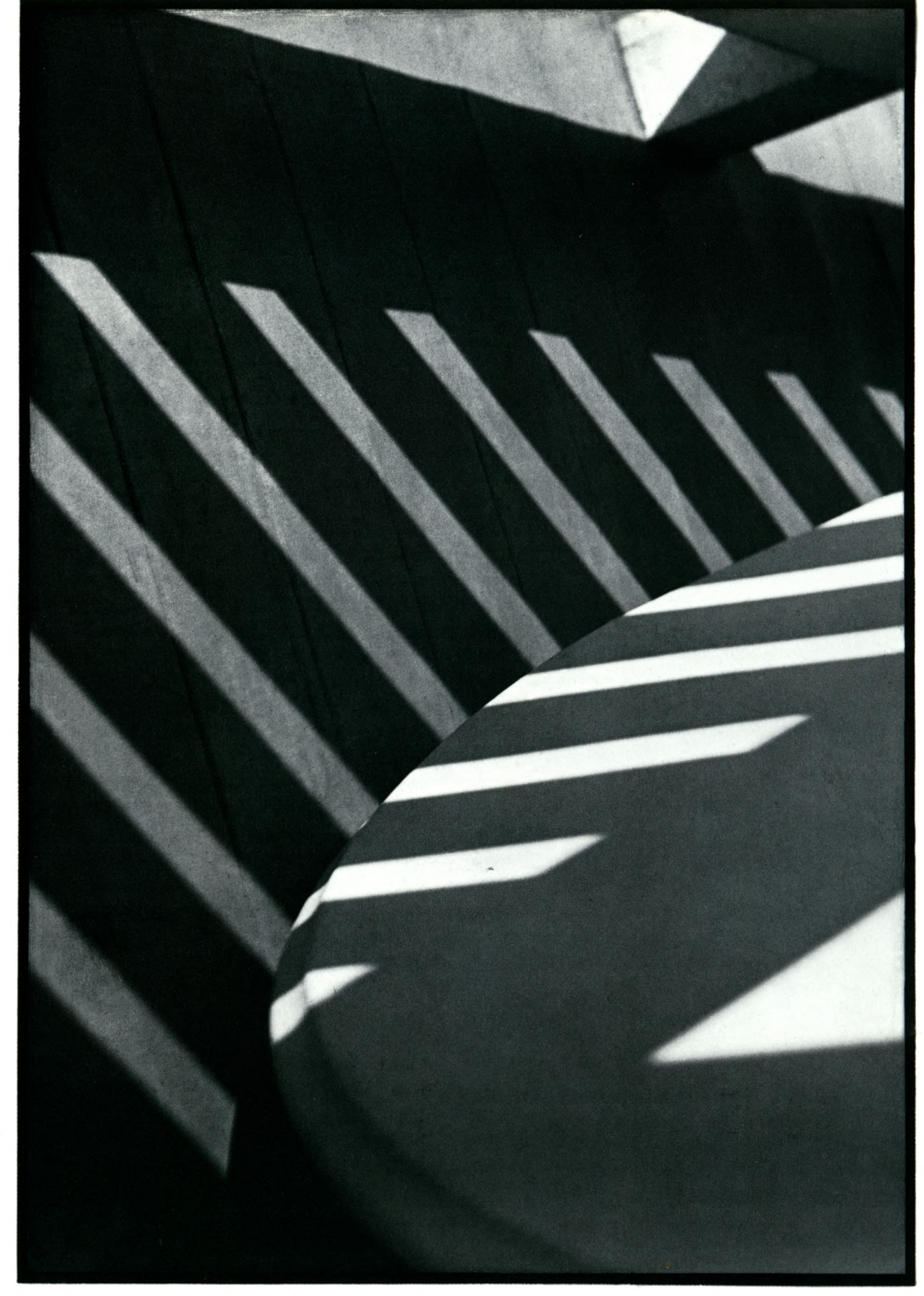
5 • Paul Strand, Abstraction, Porch Shadows, Twin Lakes, Connecticut, 1916 Silver-platinum print, 32.8 x 24.4 (12% x 9%)