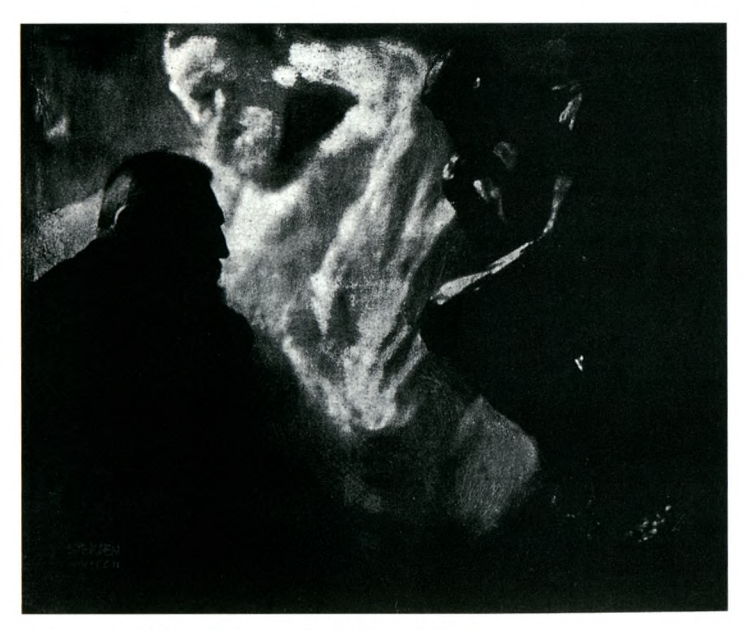
3 • Edward Steichen, Rodin and The Thinker , 1902 Gum-bichromate print

It would be this principle of rhyming, but now emptied of its social content and, almost, of any recognizable content what-