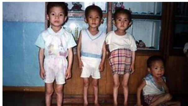
Famine in North Korea