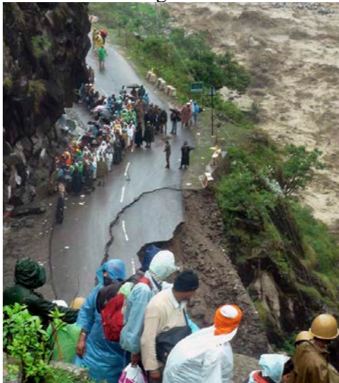
Monsoon flooding and land slides