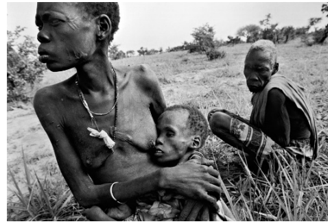
Famine in Uganda, Africa- Chreator children

No Man types can bring any kind of Breathing or Life. No one can exist by Man. It is emotionally, physically, and mentally painful to see and know that my children are suffering like this because of the man devel prisoners who took over my Earths Chreations.