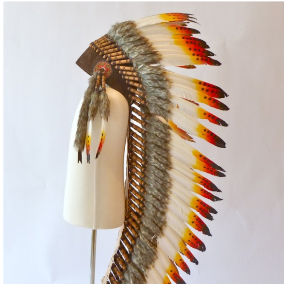
Earths Leaders Headdress Trail