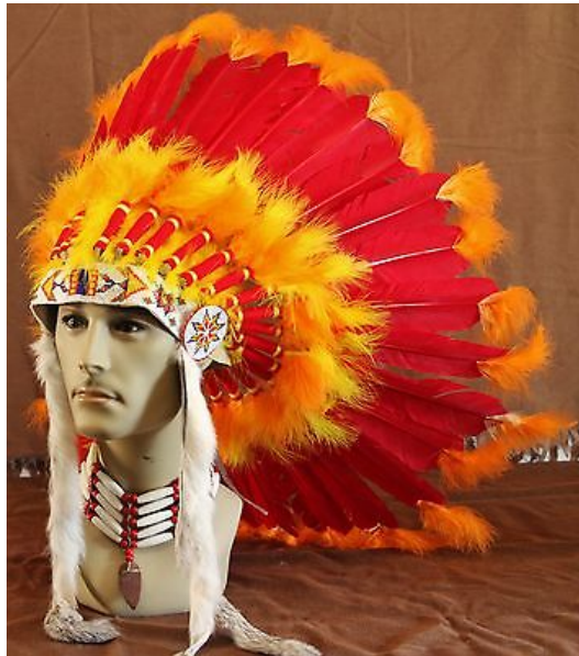
Earths Leaders Headdress

All my children (YOU), in the Chreator Chreations and the Central areas including Russia, that the devels stole and tore out, are the highest leaders over my Earths. The devels stole the best of the best of the best of the best with the belief that they will use this control to take over all the other part of my Earths.