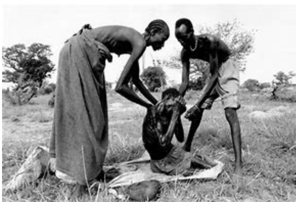
Famine in Uganda, Africa