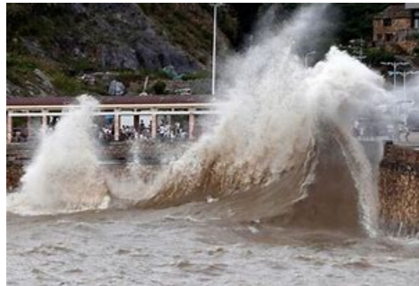
Typhoon disaster Guangdong