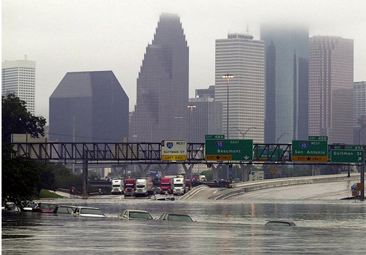
downtown Houston, Texas is flooded during the historic "Allison" flood of June 2001