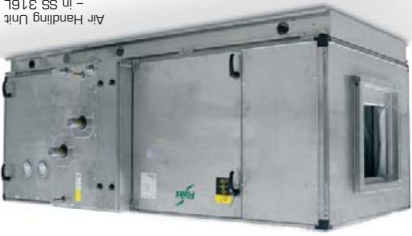
Air Handling Unit - in SS 316L

For instance; the frame members and solid corner pieces of stainless steel (316L) or composite form a sturdy framework, which is well suited to the full range of sizes.