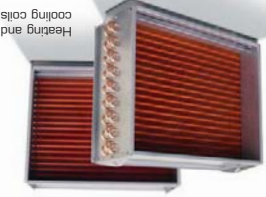
Heating and cooling coils