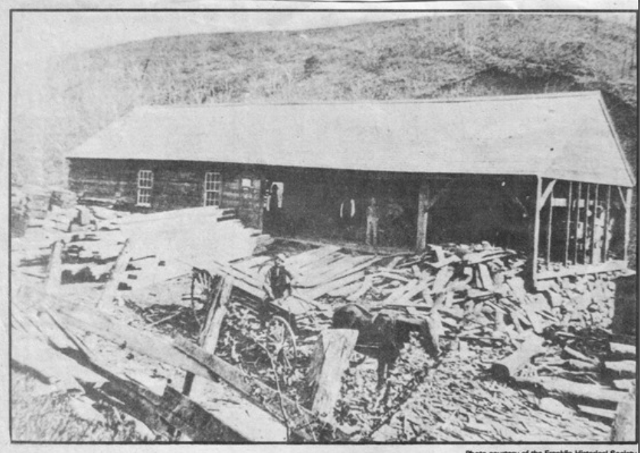
Life At The Sawmill Men stop for a break at the Emery Sawmill on Chance Pond, West Franklin. Date is unknown.