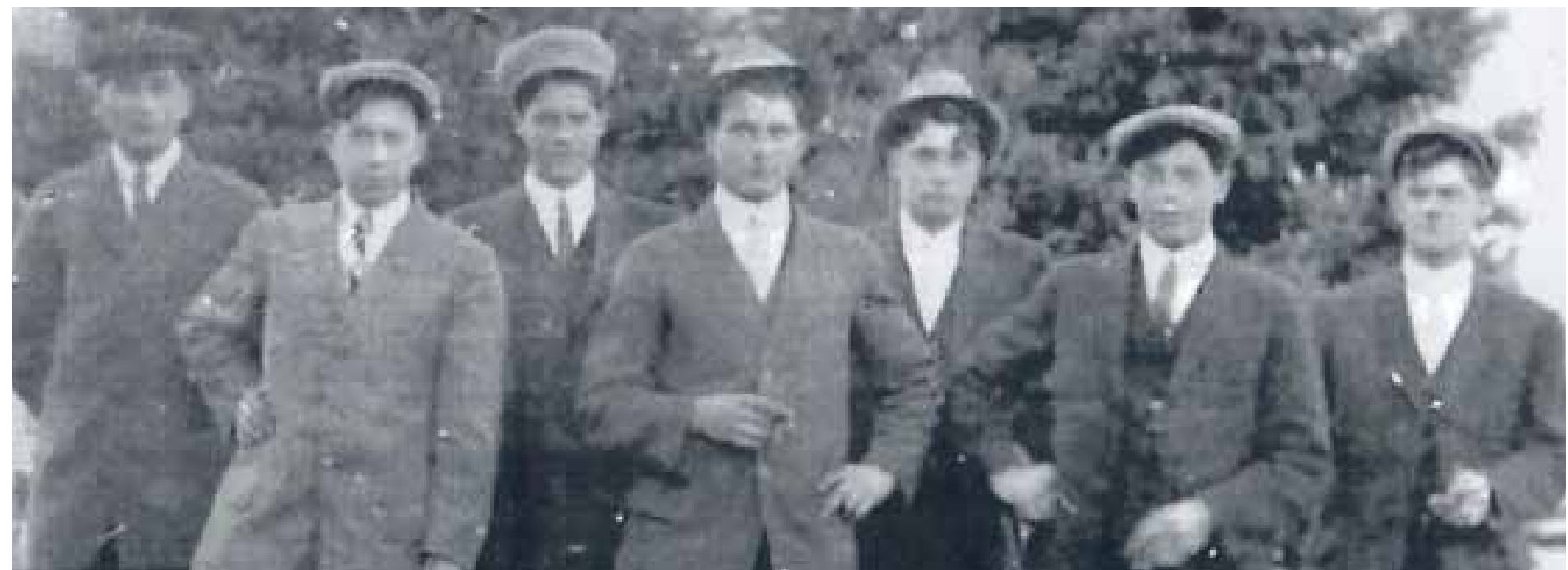
Could your Opa be one of these dressed up young men near the former West Amana flour mill. Contact "RC" or the Heritage with your response.

For further information regarding your local government visit our website www.aclud.org or call the office in Amana at 319-622-3840.