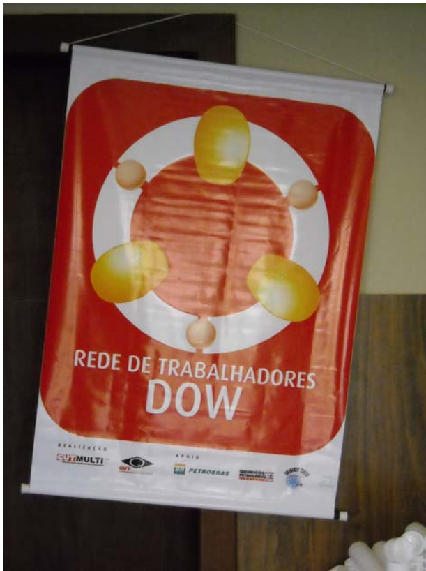
Network of Dow Workers