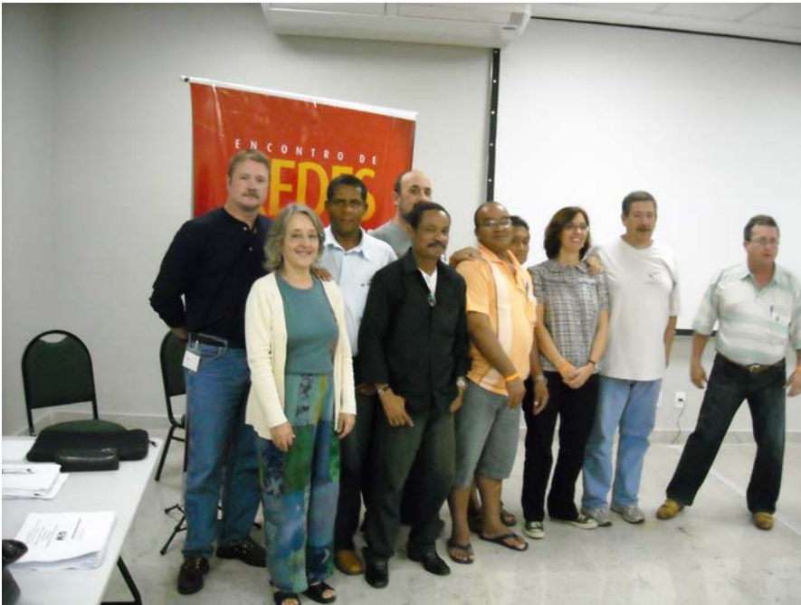
Delegates and participants from the newly formed network of Dow Chemical Workers