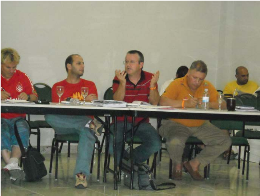
Delegates discussing the need to create networks.