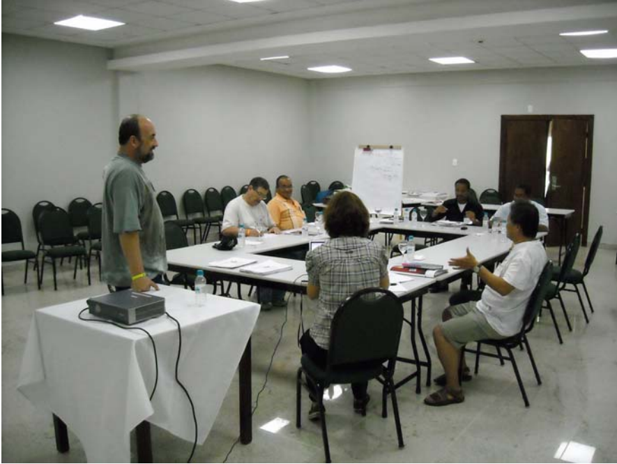
Delegates in the newly formed network of Dow Chemical Workers in discussion