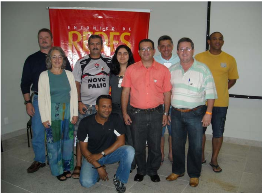
Delegates and participants from the newly formed network of DuPont Workers