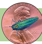
Figure 2. Size of emerald ash borer adult compared with a penny

Adults are recognized as metallic, wood-boring beetles (Family Buprestidae) by their short saw-toothed antennae, blunt head and elongate yet compact body with metallic coloration.