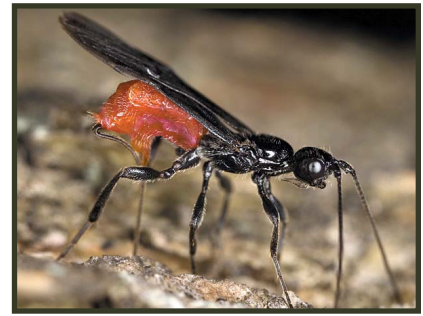
Figure 19. Braconid wasp, Atanycolus cappearti , of emerald ash borer