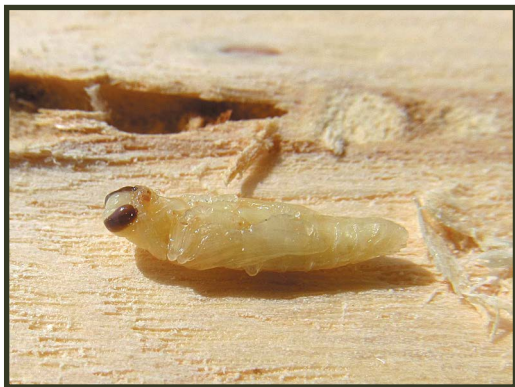
Figure 8. Emerald ash borer pupa

As the beetle within develops, the pupa takes on the adult form. When the adult emerges, the pupal exuvia (shed skin) remains in the pupal chamber. By contrast, two other common ash-boring insects, ash/lilac borer ( Podosesia syringae ) and carpenterworm ( Prionoxystus robiniae ), have the pupal skin partially or mostly extruded from the adult exit hole. Buprestids of the genus Agilus , such as EAB, leave D-shaped emergence holes (Figure 9).