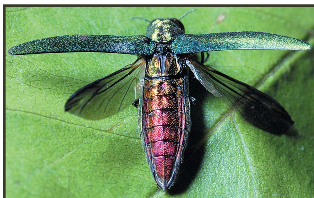
Figure 3. Emerald ash borer adult

EAB larvae (Figure 6) are recognized by their enlarged and flattened pronotum, elongate body shape with abdominal segments one to seven trapezoidal, abdominal segment eight bell-shaped, and the last abdominal segment round with two spines (urogomphi, Figure 7).