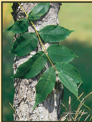
Figure 12. Black ash tree (N.D. Tree Handbook, NDSU)