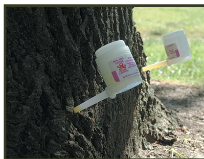
Figure 21. Mauget capsule injection for control of emerald ash borer