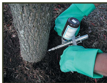
Figure 20. Trunk injection for control of emerald ash borer

Imidacloprid trunk injections resulted in less mortality and varying degrees of EAB control. Overall, trunk-injected emamectin benzoate provided the highest level of EAB control when compared with other insecticide products and application techniques.