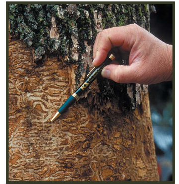
Figure 13. Larval galleries of emerald ash borer

Visible symptoms of damage are dieback of the tree crown (Figure 14) and excessive sprouting (epicormic branches) along the main stem of the tree (Figure 15). However, these symptoms are unlikely to be seen during the first year of infestation. Instead, dieback probably will be observed only in trees that have been infested for three years or longer.