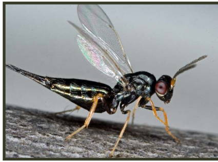
Figure 18. Eulophid wasp, Tetrastichus planipennisi , of emerald ash borer

Parasitism of EAB eggs by O. agrili was observed to be near 22 percent. For T. planipennisi , larval parasitism was at 20 percent in young ash trees and 50 to 80 percent in ash saplings, and it is spreading rapidly in all EAB-infested parts of North America. Researchers are optimistic that a combination of introduced and native parasitoids will help reduce EAB densities below a tolerance threshold so that ash trees can survive in the forest ecosystem.