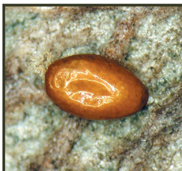
Figure 4. Emerald ash borer egg