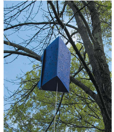
Figure 17. Purple prism trap used for surveying for emerald ash borer

Ash trees in the native range of EAB may be more resistant because their natural defenses have co-evolved throughout time. Researchers are studying Asian ash species as a possible source of resistance genes against EAB. Identification of resistant ash genotypes is important for reforestation and maintaining a market demand for ash in the nursery industry.