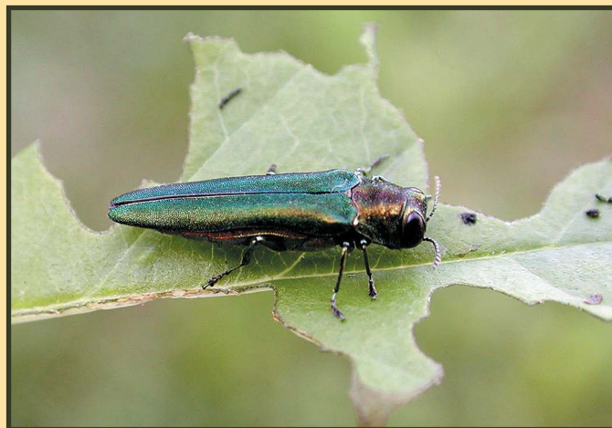
Figure 10. Emerald ash borer adult feeding on an ash leaf

Adults live for only three to six weeks and feed on foliage for one to two weeks prior to mating. Foliar feeding by EAB adults causes little damage to the ash tree (Figure 10). They mate and repeat the life cycle.