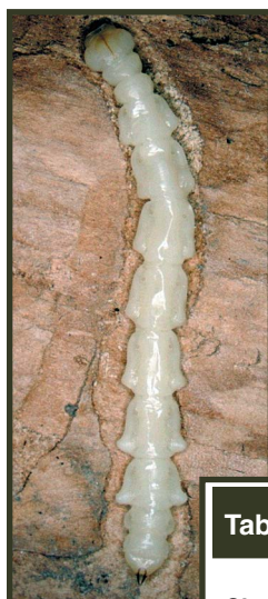
Figure 6. Emerald ash borer larva