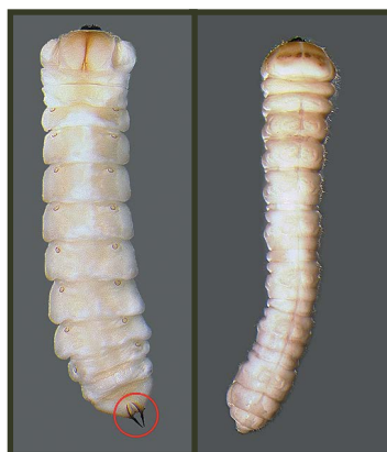
Figure 7. Comparison of prepupa of emerald ash borer (left) and red-headed ash borer (right). Circle shows two spines (urogomphi) on emerald ash borer larva (G. Fauske, NDSU)