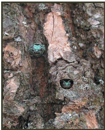
Figure 9. D-shaped emergence hole of emerald ash borer