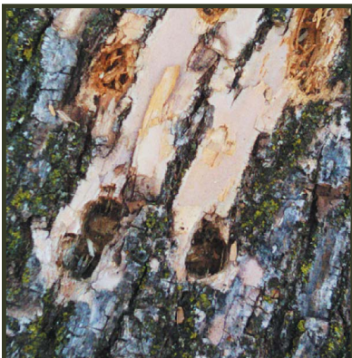
Figure 16. Woodpecker damage on emerald ash borer-infested tree

Beyond removal and replacement, the loss of benefits provided by ash trees will be enormous and expensive. Shelterbelts protect farmsteads, fields and livestock from harsh, drying winds in the summer and they capture snow in the winter, acting as living snow fences along highways and around many communities. In urban EAB-infested areas where ash trees have been destroyed, the loss of shade/protection from ash trees has resulted in increased costs associated with summer air conditioning and lawn watering, and home heating in the winter.