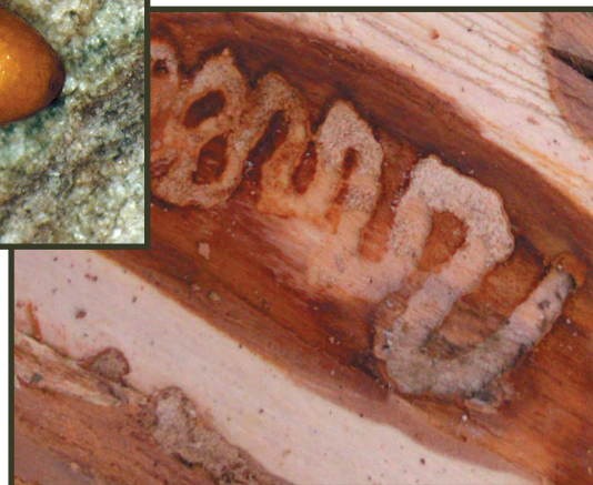
Figure 5. Serpentine tunnel created by emerald ash borer larva