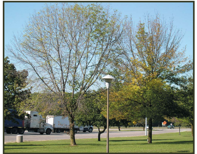
Figure 14. Dieback of tree crown