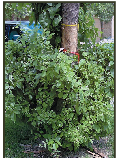
Figure 15. Epicormic branching from tree attacked by emerald ash borer