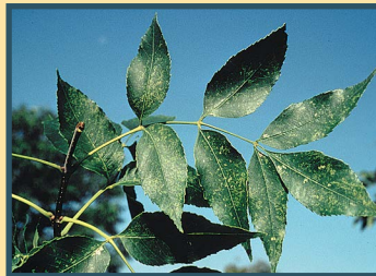
Figure 11. Green ash tree (N.D. Tree Handbook, NDSU)